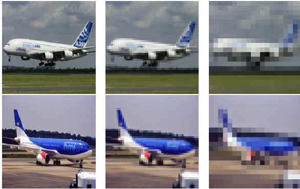
Fig. 4. Example of two Airbus airplane images (top A380, bottom A330-200) at resolutions 200 \times 200 (left), 50 \times 50 (middle) and 20 \times 20 (right). Resolution degradation occludes the discriminating details that enable distinguishing classes.

we choose as the image representation. Indeed, for features extracted on top of the fully-connected part (CNNM16), performances are competitive with those of FV at several resolutions, or even better (e.g. on PPMI for resolutions \geq 100 \times 100 ). However, when extracting features at a deepest level of the network (such as CNNM19), classification performances drop. This behaviour, observed on both datasets, tends to support the conclusion that the last layers of a network are more specific to the learning dataset, whereas the shallowest layers offer a more generic description of an input image, as shown in [29]. It could however be interesting to adapt the pre-trained weights of CNNM by fine-tuning the network on the targeted tasks.