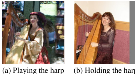
Fig. 1. Examples of PPMI images. Discriminating between people playing the instrument and people holding the instrument is a difficult task, even for a human eye.

Many methods have recently emerged to address the fine-grained classification problem. Fisher Vectors [6], extending Bag of Visual Words [7, 8, 9, 10, 11], have achieved particularly good results on multiple image classification tasks [12]. Recently, deep networks [13, 14, 15] and more specifically Convolutional Neural Networks have also obtained outstanding performances on several large scale image classification datasets [16, 17, 18]. Due to their complex structure, these nets usually have several dozen million weights: such complex architectures cannot be properly trained on mid-scale datasets. However, recently, they have successfully been used