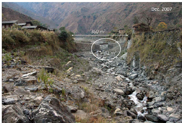
Fig 2. Ghatte khola, very narrow, undersized hydraulic, cross sectional area of the road bridge, that was destroyed by the monsoon flood in late July 2008 (first season following bridge construction) .

Although most of the time it is completely dry in its fan, the Ghatte khola (Dana village) is affected by sporadic, destructive debris flows during spring. Generated by a series of landslide dam outburst floods up in the catchment, the debris flows may dam the KG for a few hours like in 1974 (Fort 1974). The design of the new road across the apparently “safe”, large, flat Ghatte Khola alluvial fan may turn out to be more dangerous than initially thought, as shown by the poor design of the bridge (fig. 2), now replaced by a ford reinforced by gabions.