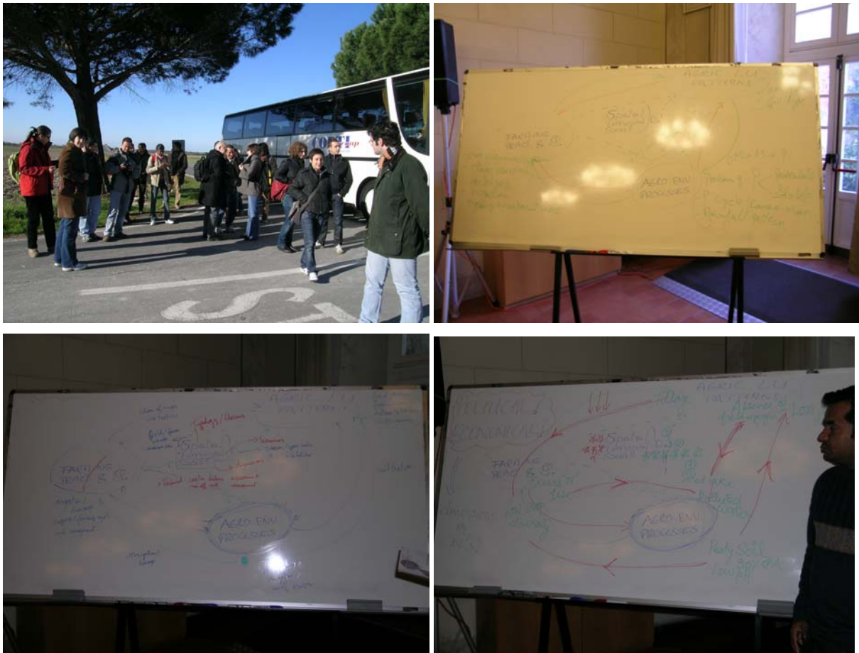
Figure 2. Field trip and three case study analyses according to the theoretical framework created by the WSLA teaching team.