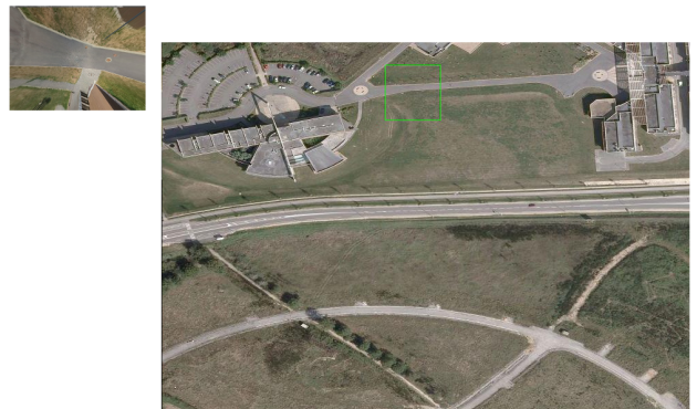
Figure 5: Example of top-down view localization in the aerial image. The top-down view T is the small image on the top left of the Figure, while the green area in the large aerial image A denotes the found localization of T .