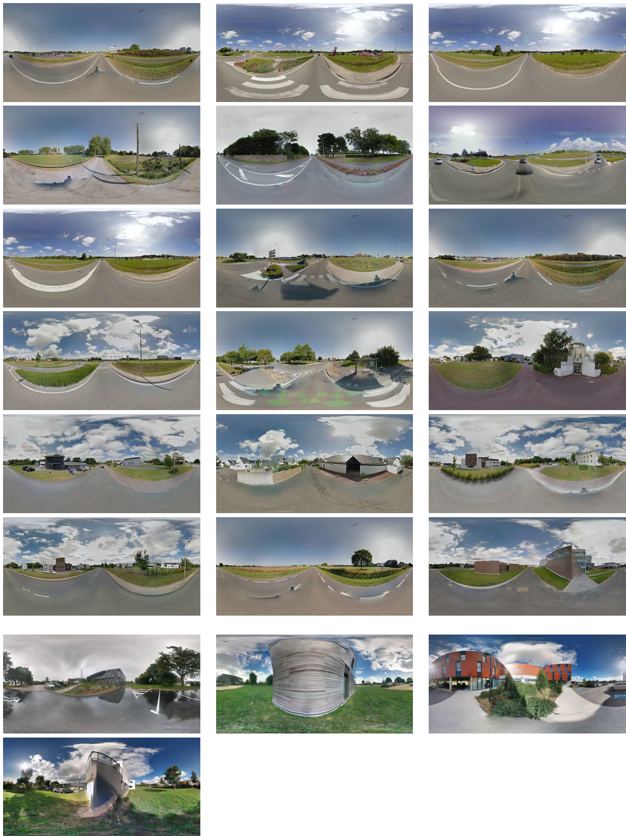
Figure 6: Panorama images used in experimental evaluation. Images from the 6 top rows were grabbed from Google Street View while the 2 bottom rows correspond to images acquired through crowdsourcing with mobile camera.