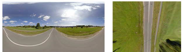
Figure 3: Example of a top-down view T (right) constructed from a panorama image P (left).

The panorama images used in this work cover (360°, 180°) field of view on (horizontal, vertical) dimensions. For a given scene, the panorama image P is warped to obtain a bird's eye view T (as shown in Fig. 3). To do so, the 3D model of spherical image is first reconstructed using ground line following the method proposed by Xiao et al. (2012). Next, for each pixel in the top-down view, the position of the corresponding pixel in the panorama is computed using the inverse warping. The color for the ground location is then obtained using bi-linear interpolation from the panorama pixels.