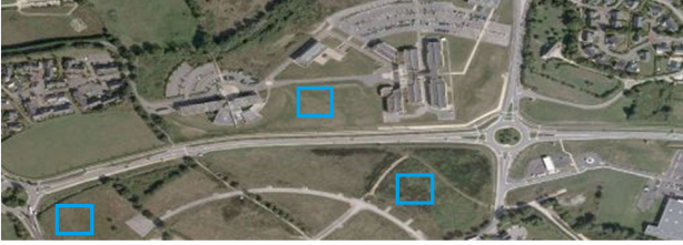
Figure 1: Aerial map from Bing Maps© with blue rectangles highlighting zones that have been recently transformed.

The study area focuses on Vannes city in France, more precisely on the surroundings of the Tohannic Campus which hosts Université Bretagne Sud and IRISA research institute where are affiliated the authors. This choice is motivated by: i) the availability of ground truth that can be assessed by the in situ, and ii) the appearance of many new buildings over the last few years (with availability of data acquired both before and after these changes). It covers a 1 km 2 area. The geographical extent is provided in Fig. 1.