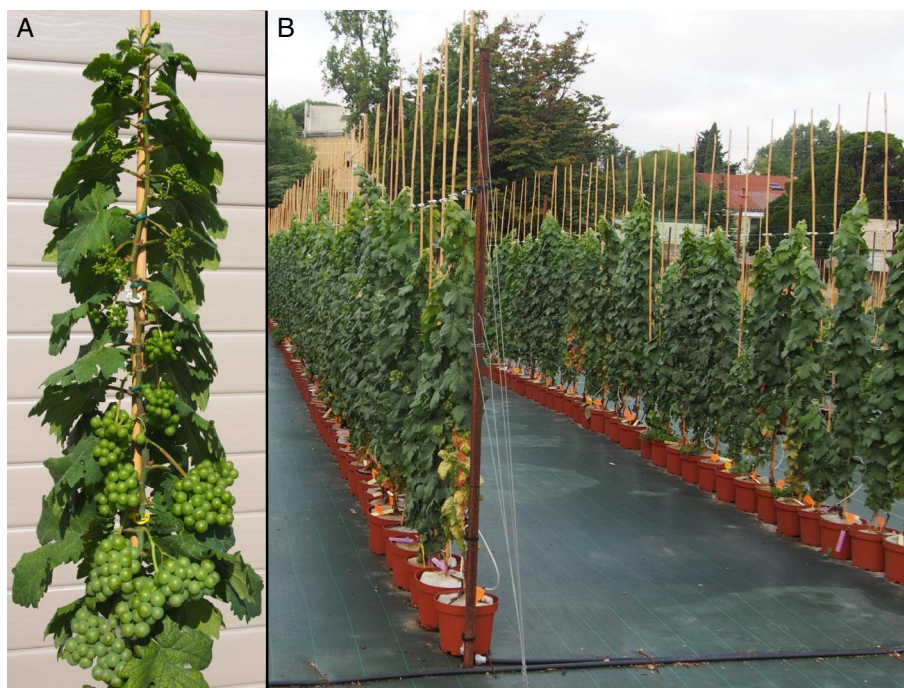
Fig. 3 The microvine mapping population derived from the cross between Picovine and Ugni Blanc flb . (A) Microvine plant with continuous reproductive development along the proleptic axis. (B) The population grown outdoors in pots

also grown in growth rooms under controlled environments, during one month. Temperature treatments were 20°/15 °C and 30°/25 °C (day/night) for “cool” and “hot” treatment, respectively. Each treatment was applied to a single copy of the population. A 14-h photoperiod was imposed. In the growth rooms, mean Vapour Pressure Deficit (VPD) was maintained between 0.7 and 1.8 kPa during photoperiod and average daily Photosynthetic Active Radiation (PAR) per day was around 20–25 mol.m -2 . The different climatic conditions during plant growth are summarized for all environments in Additional file 11.