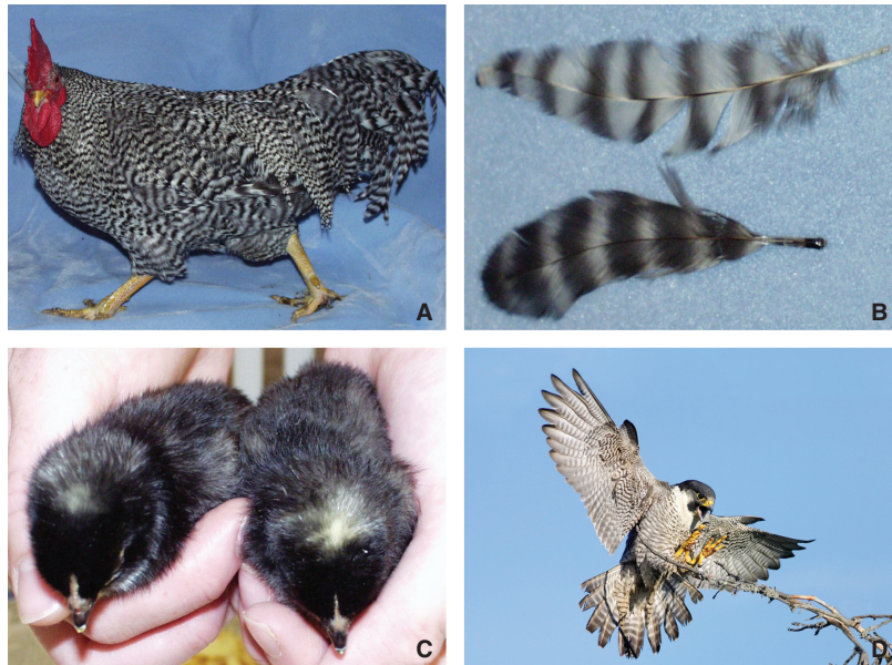
Figure 1. (A) A Barred Plymouth Rock adult rooster ( B^*B/B^*B ) showing the Sex-linked barring feather pattern, where white bars are approximately twice the width of black bars. (B) A number 2 under major tail covert feather (counting from medial to distal) taken at 8 weeks of age from a B^*B homozygous male (top) showing considerably wider white bands compared to a feather taken from a B^*B/W hemizygous female (bottom). (C) At hatch, Barred Plymouth Rock chicks display a white spot on their heads. The B^*B/W female (left) has a smaller spot compared to the B^*B/B^*B male (right). (D) Peregrine falcon exhibiting barred feathers.

plumage colour have been characterized at the molecular level (Chang et al., 2006; Gunnarsson et al., 2007; Kerje et al., 2003, 2004; Vaez et al., 2008). Two particularly interesting phenotypes involving the pattern of pigmentation are Sex-linked barring (Figure 1) and autosomal barring (Crawford, 1990). The difference in appearance of these barring patterns is that Sex-linked barring is characterized by bars with complete absence of pigmentation whereas autosomal barring produces alternating bars with darker and lighter pigmentation resulting in a more irregular pattern. Most likely due to its camouflaging properties, a barring pattern is found in the wild-type plumage colour of many avian species, exemplified by the peregrine falcon in Figure 1D. The two genetically controlled barring patterns in chickens provide excellent opportunities to study the genetic mechanisms underlying this biologically important phenotype. Sex-linked barring shows a monogenic inheritance whereas autosomal barring is assumed to be caused by the combined effect of alleles at the Dark brown ( Db ) and Pencilling ( Pg ) loci (Crawford, 1990).