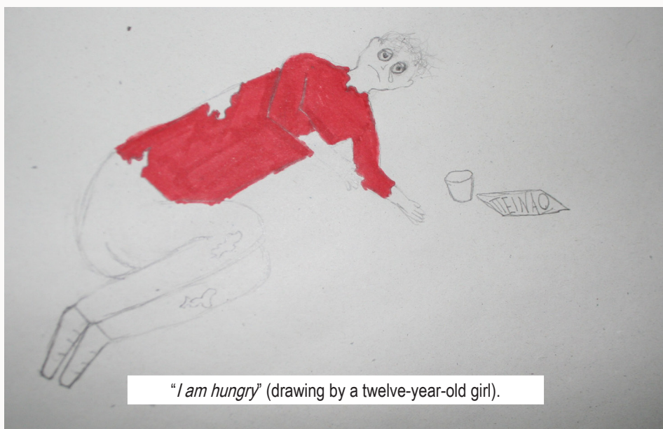
“I am hungry” (drawing by a twelve-year-old girl).