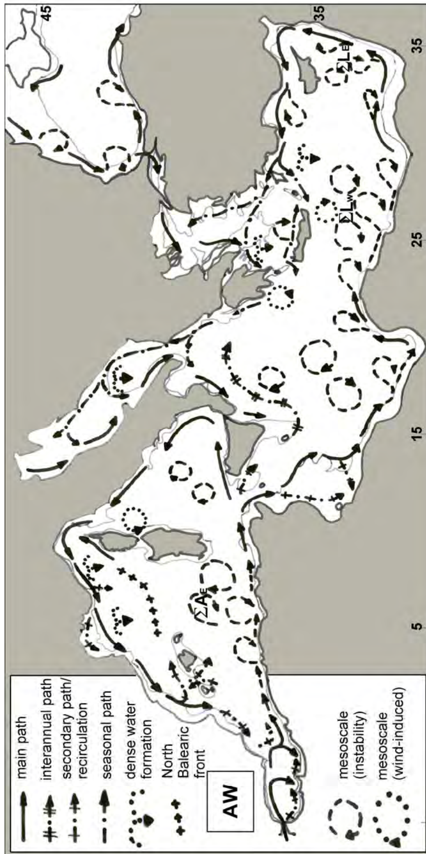
Fig. 2. Circulation of AW, inferred from [9] for the western basin and from [7] for the eastern one, and of fresh waters in the Black Sea. The thin line represents the 200-m isobath. See text for the definition of \Sigma A_E , \Sigma L_W and \Sigma L_E .