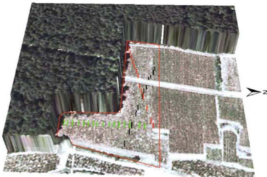
Figure 1: 3D perspective view of the stand (red line) with a vertical exaggeration of 1.5. upper-slope transect (red), middle-slope transect (black) and lower-slope transect (green) present the measurements locations. A Digital Surface Model (DSM) is draped with an aerial orthophoto IGN.

Figure 1 presents a perspective view of the experimental stand. The stand was planted with “Pinot Noir” plants in 1950 over a surface of slightly less than 1 ha. The altitude varies inside the stand from 310 m to 350 m with a eastward facing slope that reaches 25 degrees to the west. To account for the terrain complexity, a Digital Surface Model (DSM) was derived from a DEM and the height of the forest trees [5]. The neighbouring forest is composed of pure Austrian black pine ( Pinus nigra nigricans ) plantations of 64 and 50 years old, except for the little grove at the bottom eastern part of the stand (7 to 30 years). Whereas main part of the forest is located at the south and west of the vine stand.