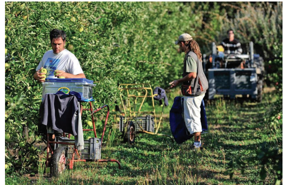
Sustainable apple production places less emphasis on the 'cleanliness' of the entire orchard.

It is important that such changes in the way performance is evaluated be shared among the farming community. Our interviews show that farmers pay much attention to advice from colleagues. The networks to which farmers belong are sources of knowledge on individual techniques but they are also the sources of standards used to evaluate performance.