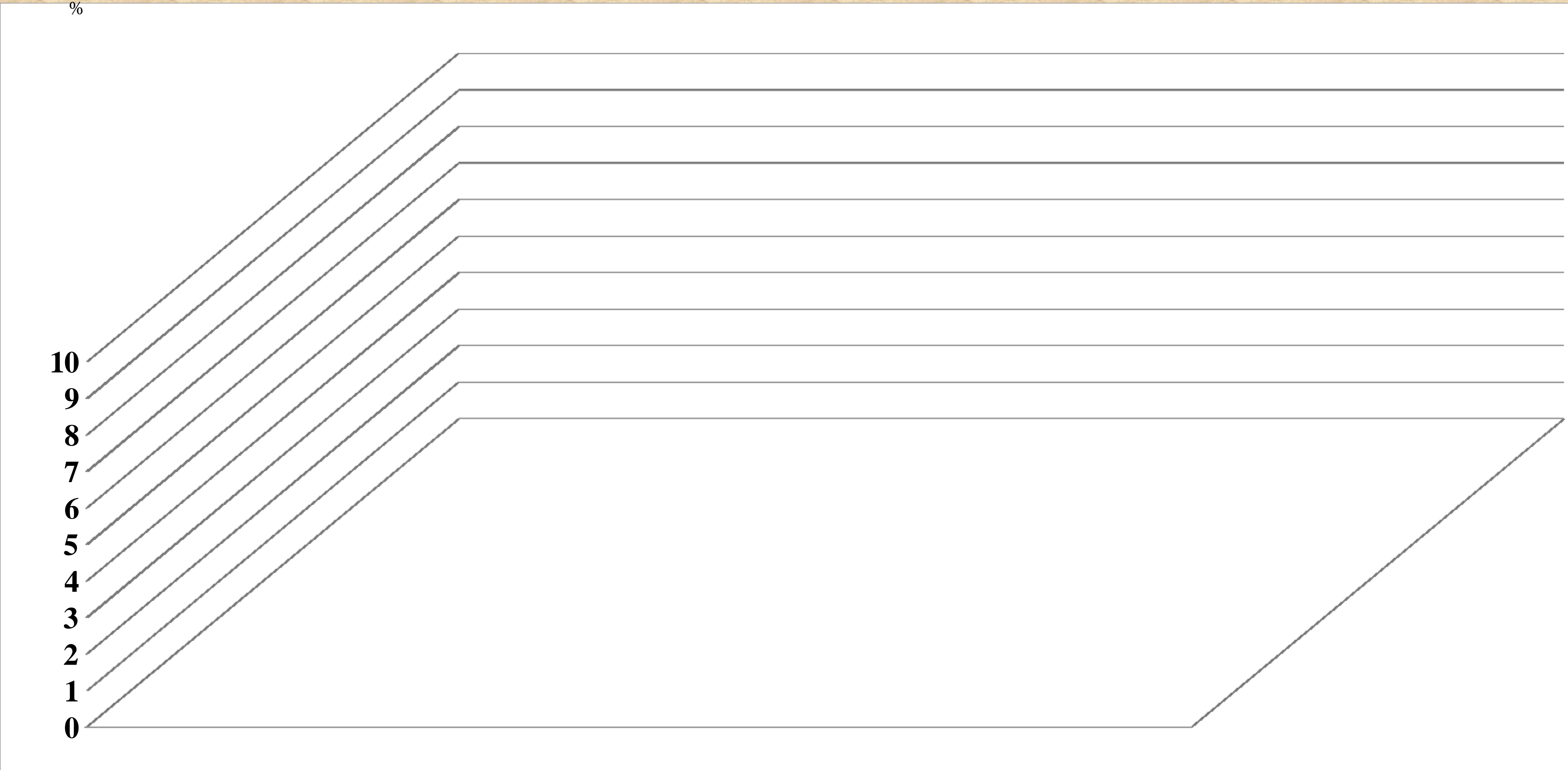
Fig. 2: Distribution of Yr genes postulated in 87 elite lines, 17 commercial cultivars and 35 wheat landraces