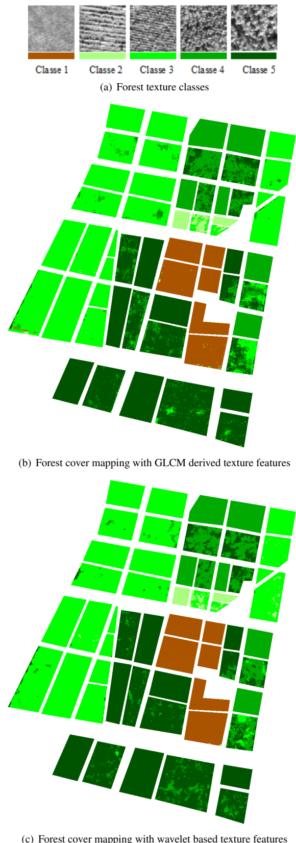
Fig. 3. Random forest classification of Quickbird multispectral image sample (ROI2) using different texture features