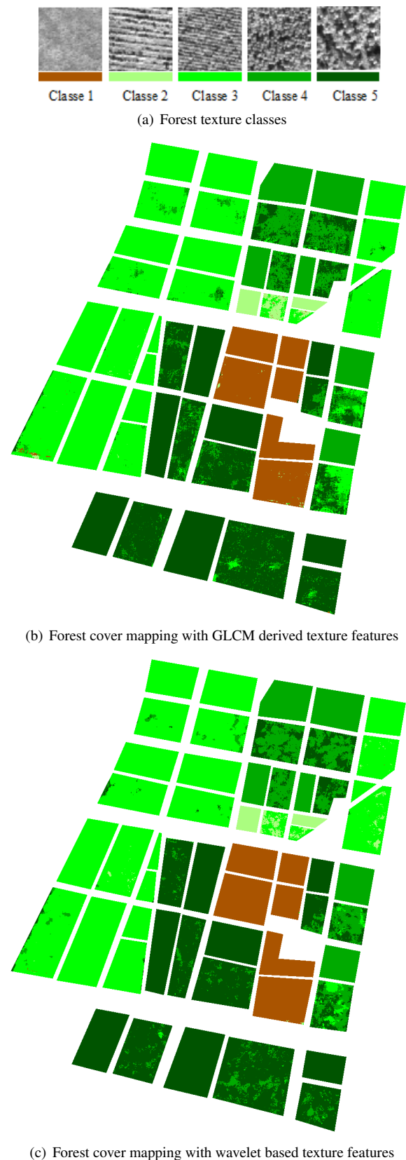
Fig. 3. Random forest classification of Quickbird multispectral image sample (ROI2) using different texture features