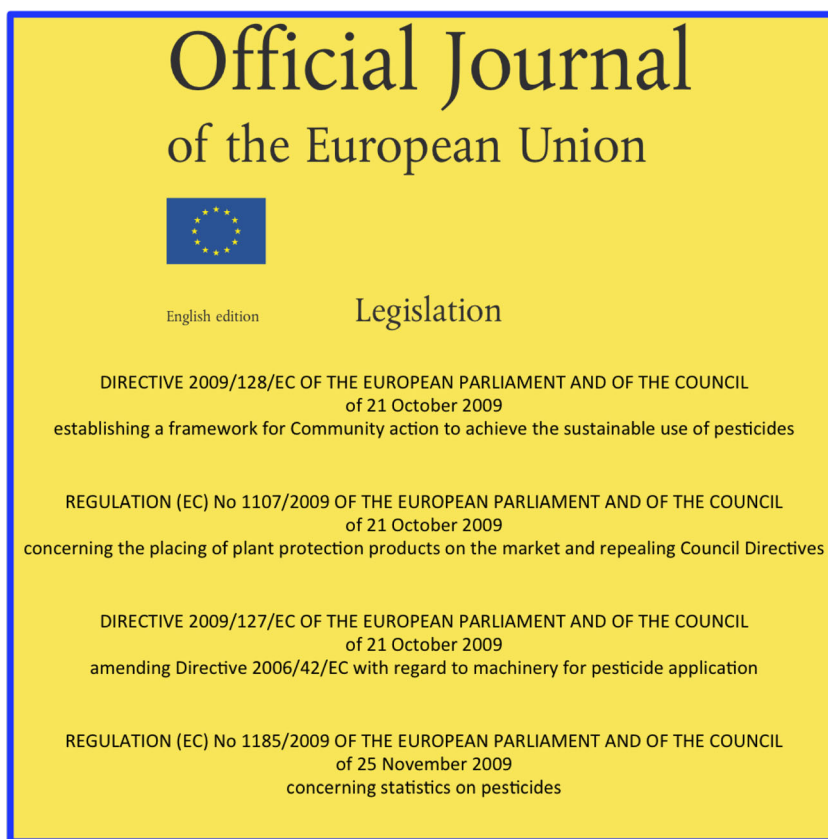
Fig. 2 The suite of 2009 European Union legislation known as “The Pesticides Package”

set up an ambitious demonstration network totaling 1900 commercial and experimental farms in 2012. The network is dedicated to generating and sharing information on the technical and economic feasibility of reducing reliance on pesticides (DGAL 2014). Most arable cropping systems under scrutiny reduced their treatment frequency index by at least 10 %. Economic analyses show no antagonism between pesticide use reduction and profit (Pillet 2014). Germany recently set up a system of demonstration farms in a number of crops where farmers supported by scouts, advisors, and scientists change their cropping practice and voluntarily apply a self-auditing assessment tool (Peters et al. 2013). Initial results from the demonstration farms show that, although labor-intensive, monitoring support and guidance does translate to reduced pesticide use (Freier et al. 2012). The data collected during the 2012–2013 season show that the treatment frequency index in winter wheat, winter barley, and winter oilseed rape was significantly lower in the demonstration farms relative to the reference farms (Peters M. pers. communication). In the UK, the Linking Environment and Farming partnership program has set up demonstration farms and research innovation centers to promote on-farm IPM uptake associated with environmental self-audit tools (LEAF 2013).