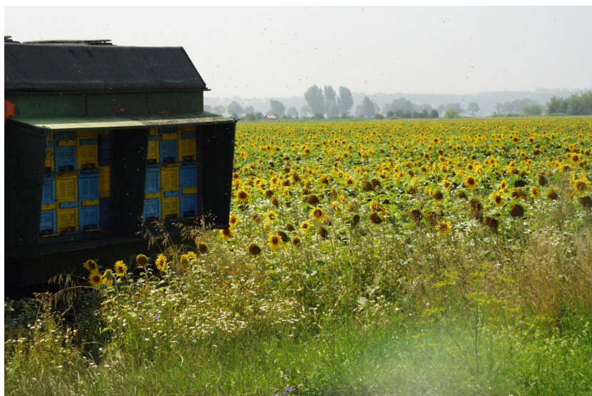
Fig. 8 Principle 5—Protecting honeybees is one criterion used for pesticide selection

Maize-based cropping systems offer an illustration of the importance of crop rotation. Continuous maize cultivation is widespread in Europe for grain production as well as for silage and energy production. Rotation has been demonstrated as key to reducing reliance on pesticides while allowing the successful management of the invasive Western corn rootworm Diabrotica virgifera virgifera as well as several noxious weeds (Vasileiadis et al. 2011). In Europe, the Western corn rootworm can be considered as a pest of a specific maize cultivation system because the complete egg-to-adult development of the pest extends through two maize cultivation cycles. When maize is rotated with a non-maize crop, the cycle of this pest is broken and its population decreases to minimal levels. Because of the multiple on-farm uses of maize