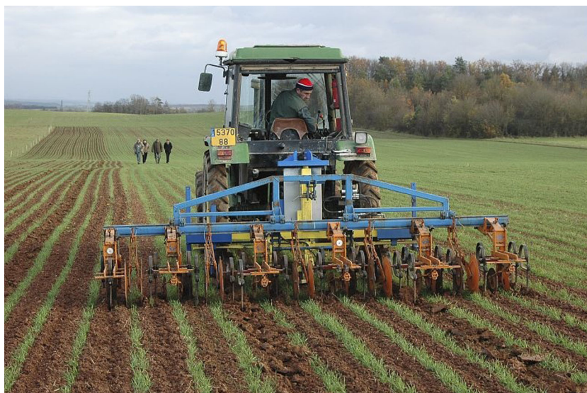
Fig. 7 Principle 4—Mechanical weeding is a major alternative to herbicide use

families is a major lever to strengthen robustness of cropping and farming systems. In this context, robustness refers to stabilizing agronomic performance in spite of disturbances caused by the presence of pests. A diversified crop sequence prevents selection and buildup of the best-adapted pest populations. As a general rule in arable crop rotations, alternating winter and spring-summer crops is recommended as this will break the life cycle of many pests, particularly weeds, more efficiently than a rotation with just winter or summer crops. Similar principles can also be developed for vegetable cropping systems where rotation between leaf and root crops is promoted, while the frequent occurrence of crops within the same botanical family is discouraged. For many specialist fungal pathogens, the selection of different crop families within a rotation effectively reduces pressure. There are other plant pathogens characterized by broad host range that need to be treated differently, however. Such is the case of the bacteria