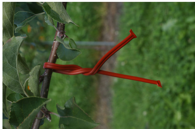
Fig. 6 Principle 4—Pheromone mating disruption is an alternative to chemical control against several lepidopteran pests of fruit