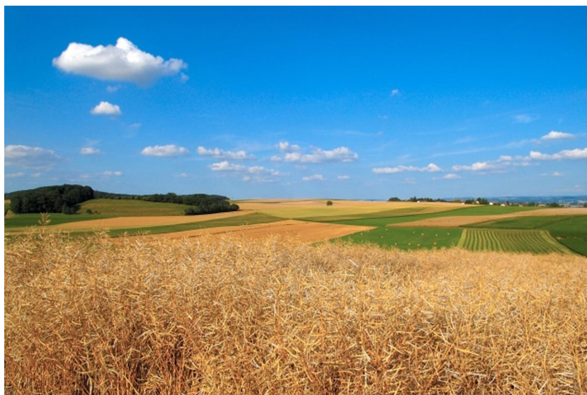
Fig. 4 Principle 1—Diversifying crop rotation in arable crops as a preventive strategy

(Pesticide Use-and-risk Reduction in European farming systems with Integrated Pest Management, www.pure-ipm.eu ) evaluates the feasibility of combinations on six different cropping system types. This European project successfully tested various combinations integrating the following tactics in maize-based cropping systems: foregoing pre-emergence herbicides, establishing a false seedbed, harrowing at the 2–3 leaf stage, use of low-dose post emergence herbicide, hoeing combined with postemergence band-spraying, and Trichogramma releases against European corn borer, Ostrinia nubilalis (PURE 2013).