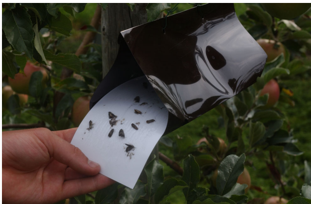
Fig. 5 Principle 2—Pheromone traps are commonly used in orchards to monitor lepidopteran pests of fruit

Spatial and temporal diversification is key to minimizing pest pressure and achieving effective prevention. In organic arable crop farming, crop rotation is the most effective agronomic alternative to synthetic pesticides (Fig. 4). In annual crops, the manipulation of crop sequence to break the life cycle of pests through rotation with crop species belonging to different