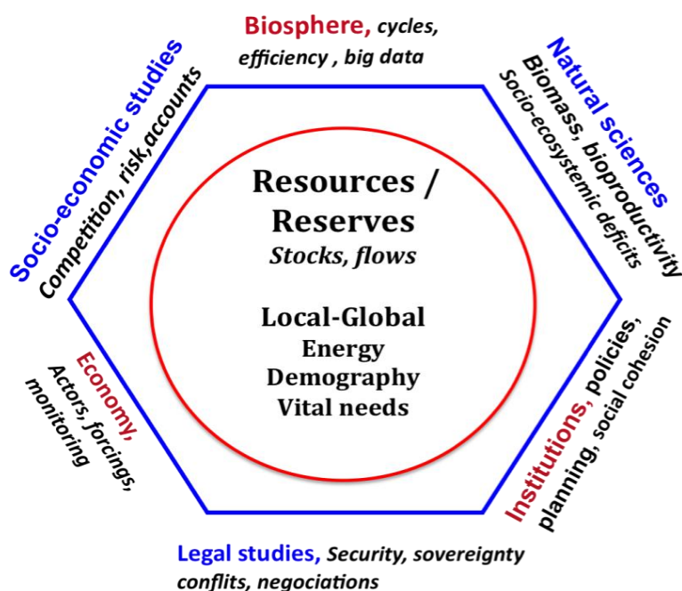
Figure 1. The resource-systems matrix of development and ecological transition. Reframing the conceptual and operational field of natural resources makes it possible to establish more coherent and effective links between vital needs and otherwise unrelated or poorly related factors/components and the corresponding risks: food-health-education/culture, environment, energy, climate change, biodiversity, future generations and so on. This requires deep interdisciplinarity across fields encompassing legal and socio-economic studies, and life-sciences.