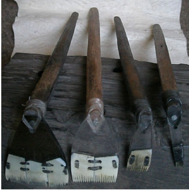
Figure 2. Set of au tā tatau (tattooing needles), tufuga tā tatau Su'a Loli Tikeli.

curved lines and au tapulu for solid black areas. Oral tradition recounts that these tools were introduced to Samoa during the extraordinary voyage of Taemā and Tilafaigā. These two Siamese twin deities are said to have given a basket of tools ( atoau ) and ceremonial privileges to some of their hosts in gratitude for the welcome they received. This founding act created two tattooing clans or 'āiga tufuga . In both these clans (Sā Su'a and Sā Tulouena), the set of tools is generally presented at the end of an apprenticeship and, when it has not been possible to train a successor in their use and to invest one with the right to use them, they are usually kept in the master tattooist's family. The possession of a set of tools thus materializes the genealogical tie linking its owner to the deities of tattooing.