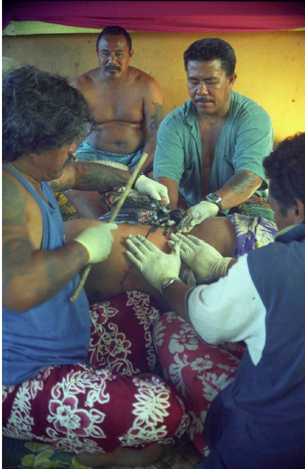
Figure 3. Tattooing operation in Apia, Samoa, June 2001 ( Tufuga tā tatau: Sulu'ape Alaiva'a ).

tā tatau often compare the creation of a tattoo to the building of a house, for in both cases the different operations must be carried out in a predefined order. As far as possible, the work must also respect a strict principle of symmetry. Symmetry centred on the body's vertical axis is a central evaluation criterion for a tattoo's quality.