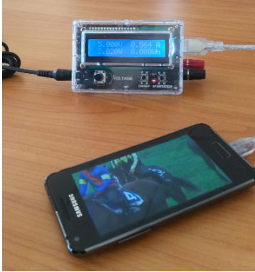
Fig. 2. Bench set-up

In this section, the demo test bench is depicted as well as the software set-up. The power consumption is measured with a ODR01D power meter device. It collects voltage, current and power of the system load. The measurements are performed at a sampling rate of 10 Hz. The Device Under Test (DUT) is directly connected to the power meter device supplying it as depicted in Fig. 2.