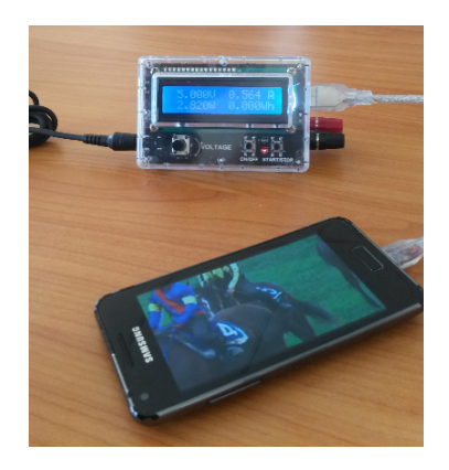
Fig. 2. Bench set-up

In this section, the demo test bench is depicted as well as the software set-up. The power consumption is measured with a ODROID power meter device. It collects voltage, current and power of the system load. The measurements are performed at a sampling rate of 10 Hz. The Device Under Test (DUT) is directly connected to the power meter device supplying it as depicted in Fig. 2.