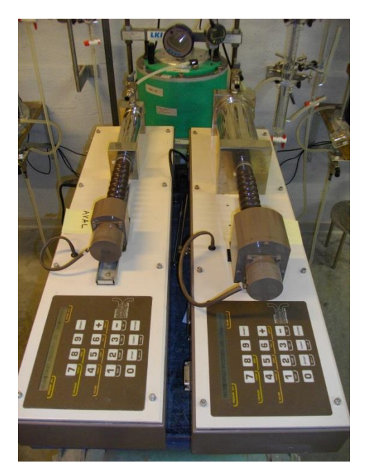
Figure 3. Experimental device for measurement of flow rates through multicomponent GCLs

A further recent development that has not yet been implemented in the standard has consisted in combining the measuring device from EN 14150 to a rigid wall permeameter in order to quantify flow rates through multicomponent GCLs. Flow rates obtained in the case presented here for multicomponent GCLs with an adhesive bounded film thicker than 0.2 mm or coating with a density larger than 200 g/m<sup>2</sup> are close to 10^{-5} m<sup>3</sup>/m<sup>2</sup>/d. This result cannot be extended to multicomponent GCLs with lighter coatings [18].