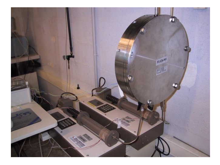
Figure 1. View of the stainless steel cell and pressure volume controllers of type B device for flow rate measurement in geomembranes