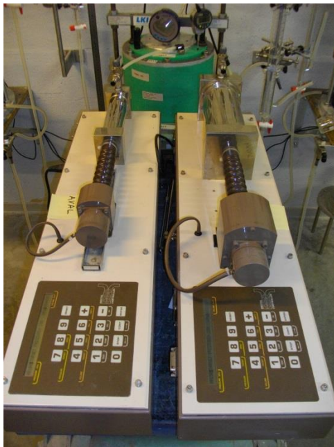
Figure 3. Experimental device for measurement of flow rates through multicomponent GCLs

A further recent development that has not yet been implemented in the standard has consisted in combining the measuring device from EN 14150 to a rigid wall permeameter in order to quantify flow rates through multicomponent GCLs. Flow rates obtained in the case presented here for multicomponent GCLs with an adhesive bounded film thicker than 0.2 mm or coating with a density larger than 200 g/m 2 are close to 10^{-5} \text{ m}^3/\text{m}^2/\text{d} . This result cannot be extended to multicomponent GCLs with lighter coatings [18].