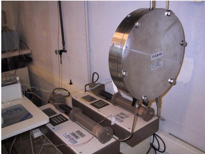
Figure 1. View of the stainless steel cell and pressure volume controllers of type B device for flow rate measurement in geomembranes