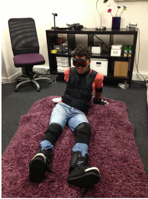
Figure 3: A young participant playing a fall scenario