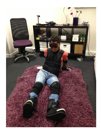
Figure 3: A young participant playing a fall scenario