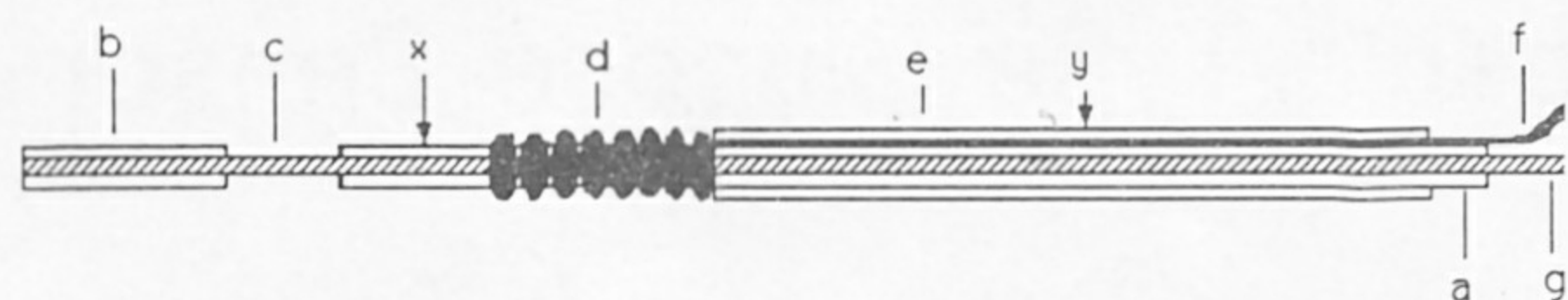
Figure 1. Schematic diagram of the sensor: (a) Teflon-coated Pt-Ir wire (0.25-mm o.d.), (b) Teflon tip, (c) sensing cavity (1-mm length), (d) Ag/AgCl reference electrode, (e) heat-shrinkable tubing, (f) reference electrode terminal, (g) working electrode terminal.

enzyme. These sensors suffer from a lack of long-term stability and possible toxicity of the mediator.