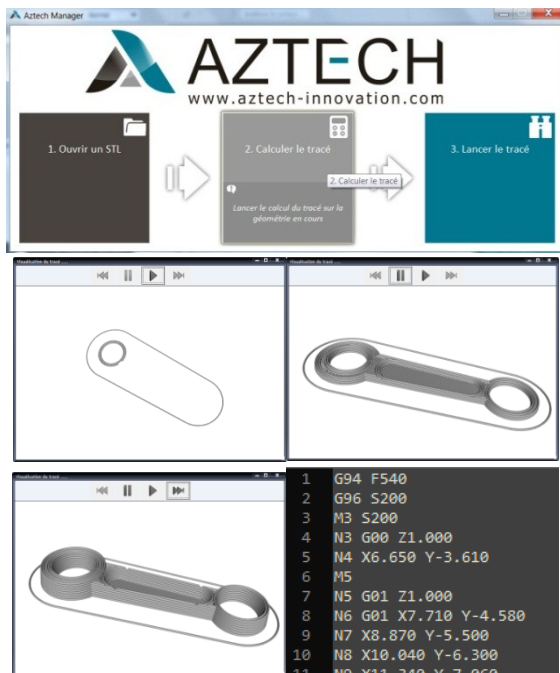
Fig 4. Additive manufacturing software for CNC machining and piston depositing system.

to carefully identify a relevant path for additive-based solution (only one pass per point, etc). That being said, such a path was still not suitable enough to be followed directly. We had to find a non-invasive solution to synchronize to position of the CNC over this path and the pneumatic pressure. This synchronization is held by the rotary tool of the CNC. A visual 3D simulator has been developed to help us check the quality of the path. Full software suite is visible on Fig 4. All the material behaviors are encapsulated into software controls which provide at the device the properties material and method necessary to make the manufacture by layers. For example, the device is capable of working with different materials which can be extruded under pressure from a wire pulling. The proper settings and configurations will be different for each material and processed by the software. They will also vary according to things such as temperature, pressure, humidity, nozzle size, etc. Therefore, you are self-sufficient and you need to determine the proper settings yourself depending on your material.