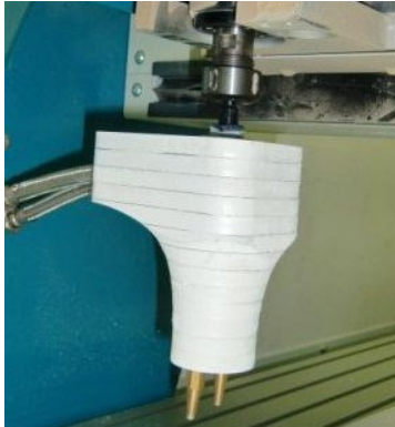
Fig 3. 3D Printing head on CNC.

Values added are the adaptation of CNC without monopolizing a specific additive machine and the opportunity to try different pulp extruded.