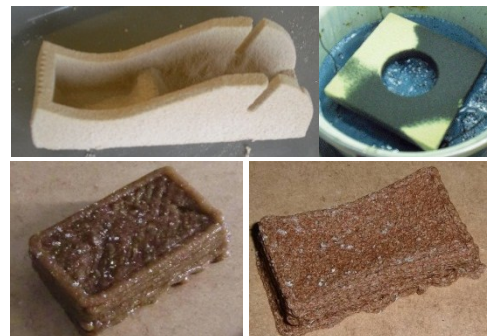
Fig 5. Review of models produced: wood powder and wood pulp.

After making several models, we observed some irregularities in their geometries. During the scan of pulp depositing, the changing of directions of tool generates protrusions mainly due to poor control of the run extrusion. Nevertheless, the shape of the model corresponds to the initial geometry and the manufacturing process has functioned according to the approach. Subsequently, internal tensions gradually deform the geometry during the drying.