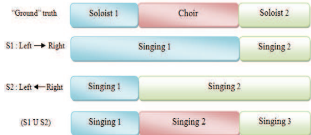
Figure 3: Illustration of bidirectional method.

Segmentation is performed by a bidirectional method. Figure 3 illustrate this method. The algorithm is executed twice on each recording. A forward pass is followed by a backward pass, which acts as verification pass. F-measure is usually increased by running a backward pass.