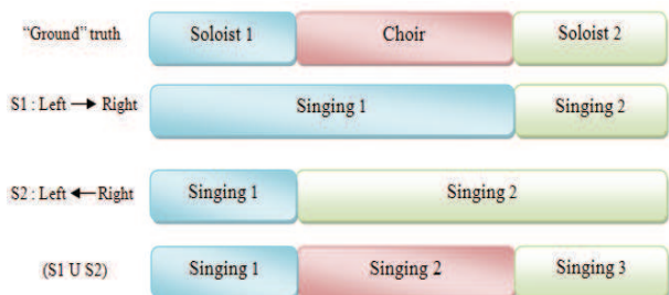
Figure 3: Illustration of bidirectional method.

Segmentation is performed by a bidirectional method. Figure 3 illustrate this method. The algorithm is executed twice on each recording. A forward pass is followed by a backward pass, which acts as verification pass. F-measure is usually increased by running a backward pass.