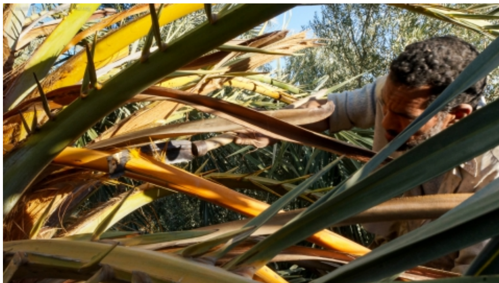
Figure 2 : An oasis farmer in the head of a date palm cutting a cluster of dates, Siwa oasis (Egypt), December 5 th , 2013

10 For the oasis system to be efficient in the Sahara, where the scarcity of irrigable lands and manure is a real concern along with the scarcity of water, all oasis populations choose the option of planting and maintaining a sex ratio of female trees of 95-99%. The “natural” sex ratio through sexual reproduction would be 50:50 male and female (about half the seeds are female and the other half male). In order to obtain almost exclusively female trees (but also to ascertain that fruit will be of the desired quality), the date palm growers make use of the asexual reproduction abilities of this plant through the multiplication of its shoots, and restrict nearly completely its sexual reproduction by seeds. Nevertheless, as the primary purpose of date palm cultivation is to harvest dates (Figure 2), effective pollination is a mandatory step to achieve successful fertilization and in fine abundant fruiting. Opting for such an artificial sex ratio requires, however, a replacement for “normal” wind pollination. Oases populations have had to invent hand-pollination as a substitute. In Saharan oases, the process of hand-pollination of the date palm is part and parcel of the knowledge and practices of date palm growers in every garden of the palm groves (Battesti 2005).