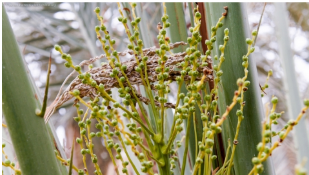
Figure 12 : Remains of a male spikelet in a growing female date inflorescence after human pollination, Siwa oasis (Egypt), May 8th, 2013

begins to form and open (Figure 12). After pollination, two of the three carpels fall; the third develops into a date. If pollination was badly conducted (or not performed), a parthenocarpic fruit, never appreciated and never sold, would grow instead of the fertilized ovary.