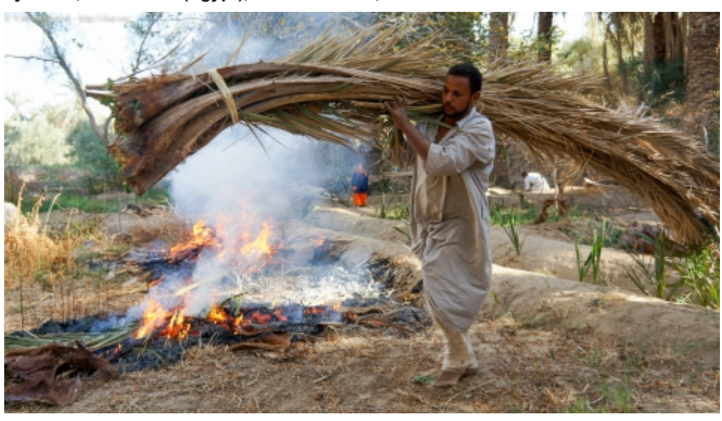
Figure 13: In all of the Sahara, the date palm is the main crop and the keystone of oasis systems, Siwa oasis (Egypt), November26<sup>th</sup>, 2013

While this interpretation is still debated, the Code of Hammurabi, the Babylonian law code of ancient Mesopotamia dating back to about 1754 B.C.E., seems to offer a consensual textual source for this practice, and we can ascertain that date palm pollination was practiced in Mesopotamia as early as the Old Babylonian Period, 20th to 16th centuries B.C.E. (Giovino 2007).