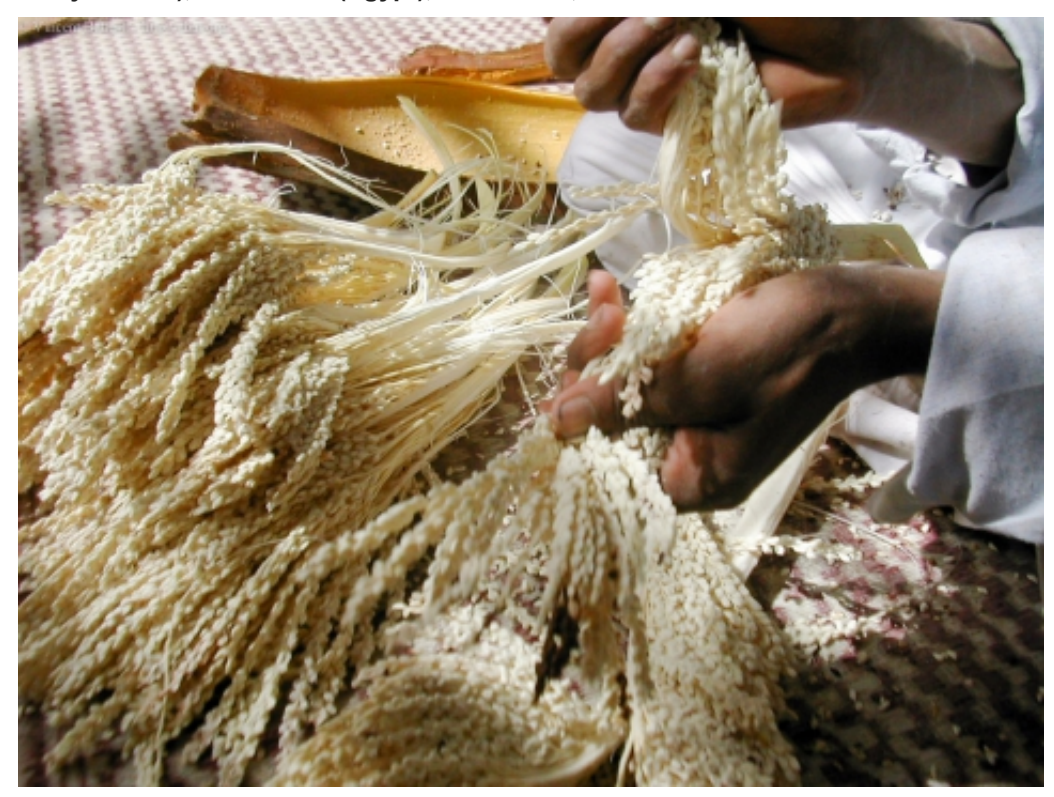
Figure 7 : Preparation of the pollen for hand-pollination of the date palm ( Phoenix dactylifera L.), Siwa oasis (Egypt), March 28^{th} , 2004