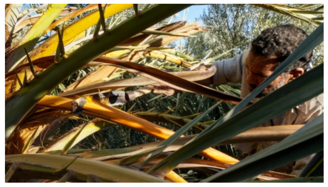
Figure 2 : An oasis farmer in the head of a date palm cutting a cluster of dates, Siwa oasis (Egypt), December 5^{th} , 2013

For the oasis system to be efficient in the Sahara, where the scarcity of irrigable lands and manure is a real concern along with the scarcity of water, all oasis populations choose the option of planting and maintaining a sex ratio of female trees of 95-99%. The "natural" sex ratio through sexual reproduction would be 50:50 male and female (about half the seeds are female and the other half male). In order to obtain almost exclusively female trees (but also to ascertain that fruit will be of the desired quality), the date palm growers make use of the asexual reproduction abilities of this plant through the multiplication of its shoots, and restrict nearly completely its sexual reproduction by seeds. Nevertheless, as the primary purpose of date palm cultivation is to harvest dates (Figure 2), effective pollination is a mandatory step to achieve successful fertilization and in fine abundant fruiting. Opting for such an artificial sex ratio requires, however, a replacement for "normal" wind pollination. Oases populations have had to invent hand-pollination as a substitute. In Saharan oases, the process of hand-pollination of the date palm is part and parcel of the knowledge and practices of date palm growers in every garden of the palm groves (Battesti 2005).