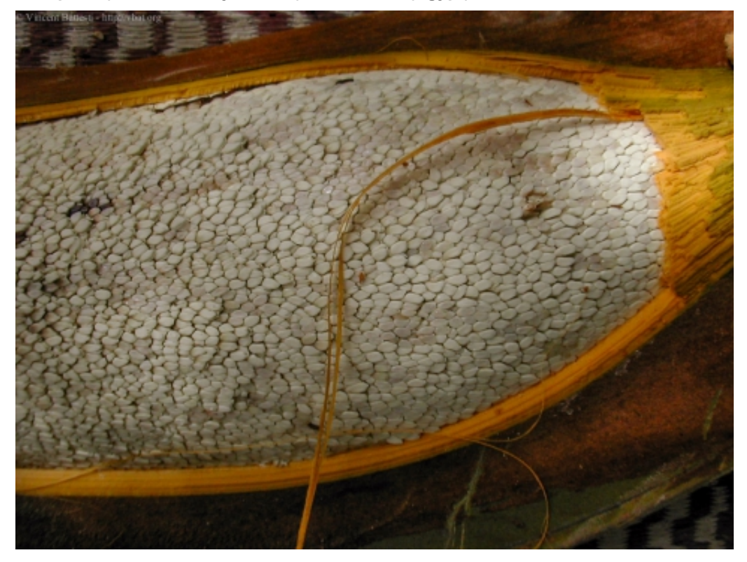
Figure 3 : The male inflorescence. Preparation of the pollen for hand-pollination of the date palm ( Phoenix dactylifera L.), Siwa oasis (Egypt), March 28<sup>th</sup>, 2004

from pollinating on windy days, judging the temperature to be too low (Battesti 2005).