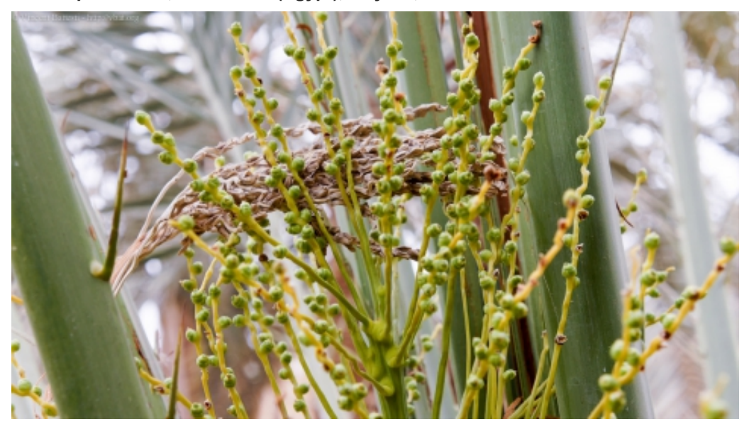
Figure 12: Remains of a male spikelet in a growing female date inflorescence after human pollination, Siwa oasis (Egypt), May 8<sup>th</sup>, 2013

begins to form and open (Figure 12). After pollination, two of the three carpels fall; the third develops into a date. If pollination was badly conducted (or not performed), a parthenocarpic fruit, never appreciated and never sold, would grow instead of the fertilized ovary.