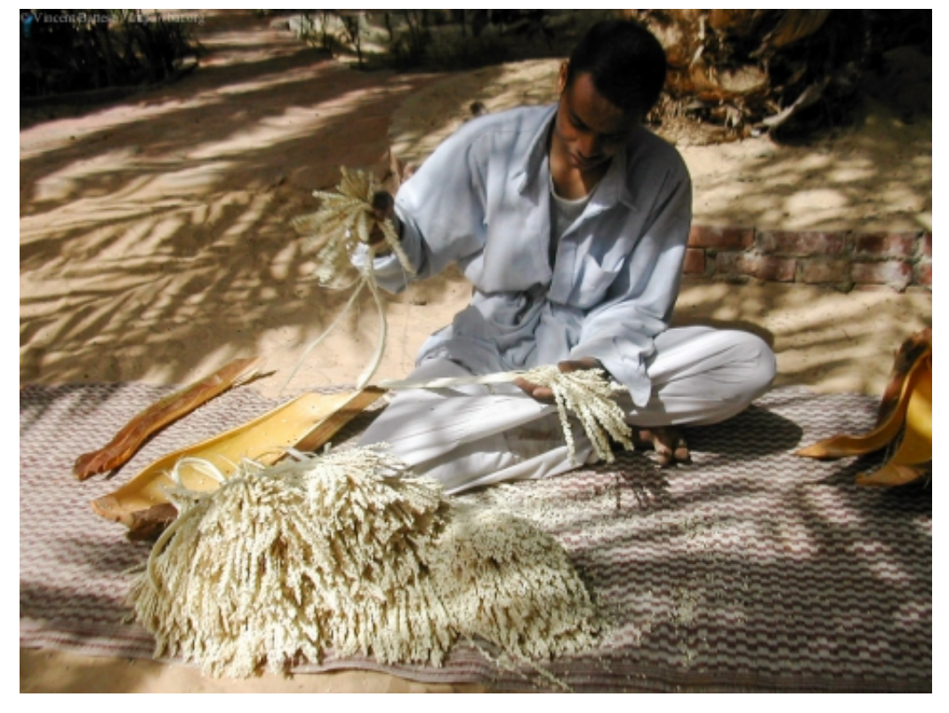
Figure 9 : Preparation of the pollen for hand-pollination of the date palm (Phoenix dactylifera L.), Siwa oasis (Egypt), March 28th, 2004