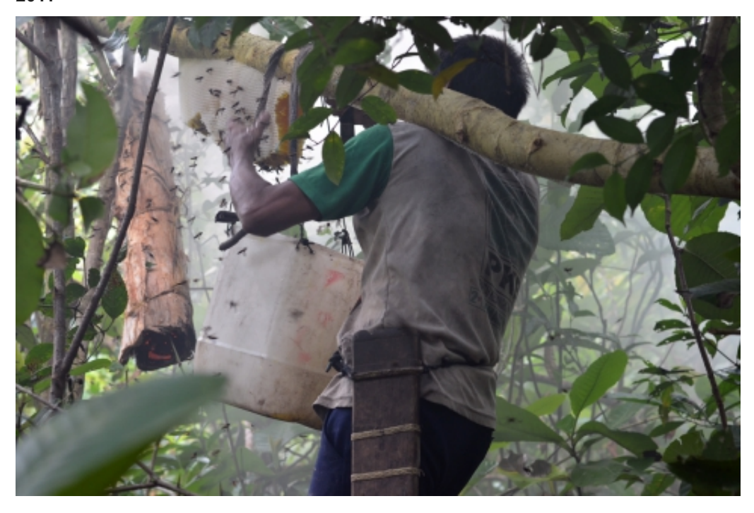
Figure 18 : After having cut the brood, the harvester takes the honey "head". Belitung, 2011

42 And the time has come to harvest honey from the comb.