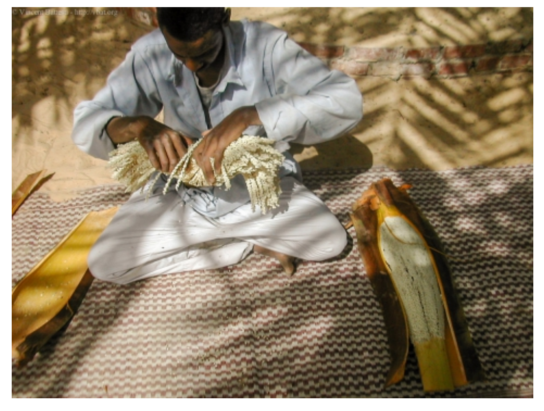
Figure 5 : Preparation of the pollen for hand-pollination of the date palm (Phoenix