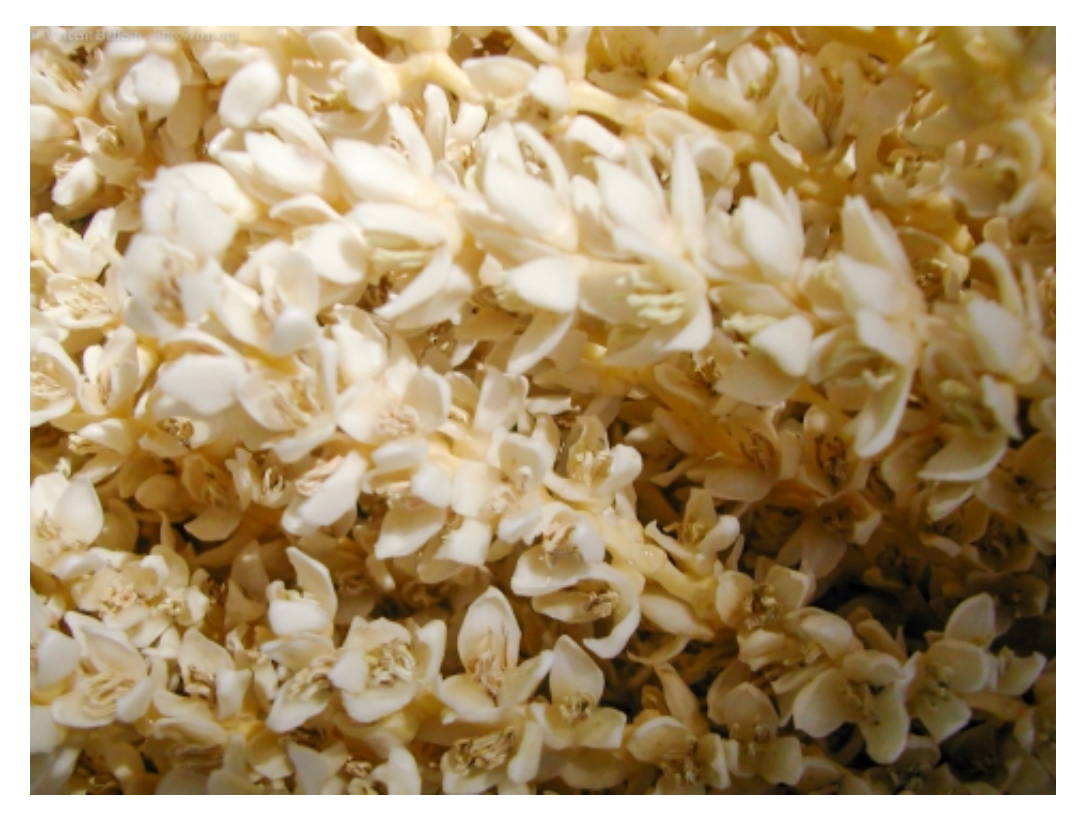
Figure 10 : A farmer climbing a date palm ( Phoenix dactylifera L.) to pollinate its female flowers with the pollen he has prepared, Siwa oasis (Egypt), March 28^{th} , 2004