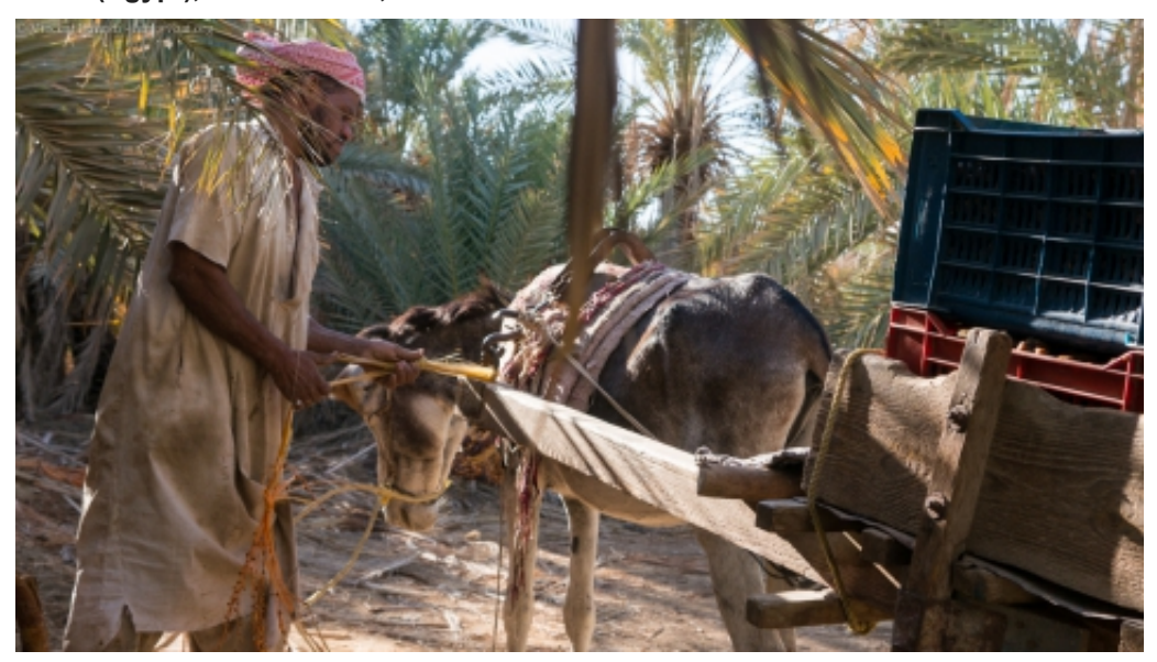
Figure 1 : Oasis palm groves are centers of intensive agricultural production. Siwa oasis (Egypt), October 23<sup>rd</sup>, 2014

Our first case demonstrates the major role that people play since millennia and in a wide variety of societies as pollinators. One example is provided by the cultivation of the date palm ( Phoenix dactylifera L., Arecaceae), a diecious anemophilous plant domesticated in the Middle East since ancient times and unknown in the wild. Its cultivation is deeply rooted in human history (Tengberg et al. 2013). Archaeological remains found in the Middle East demonstrate that the culture of dates began around the late 4th millennium B.C.E. (Tengberg 2012). The numerous hypotheses that coexist today on the origins of its domestication concur on some points but diverge on others (Gros-Balthazard et al. 2013).