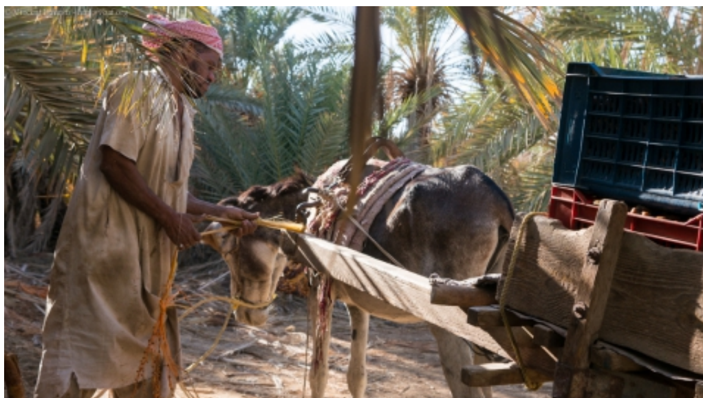
Figure 1 : Oasis palm groves are centers of intensive agricultural production. Siwa oasis (Egypt), October 23rd, 2014