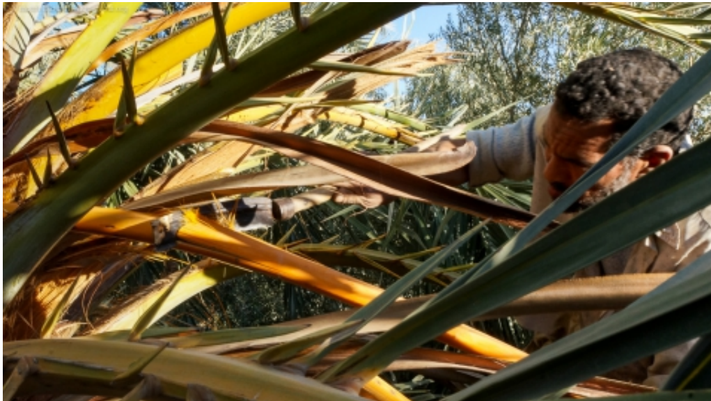
Figure 2 : An oasis farmer in the head of a date palm cutting a cluster of dates, Siwa oasis (Egypt), December 5 th , 2013

10 For the oasis system to be efficient in the Sahara, where the scarcity of irrigable lands and manure is a real concern along with the scarcity of water, all oasis populations choose the option of planting and maintaining a sex ratio of female trees of 95-99%. The “natural” sex ratio through sexual reproduction would be 50:50 male and female (about half the seeds are female and the other half male). In order to obtain almost exclusively female trees (but also to ascertain that fruit will be of the desired quality), the date palm growers make use of the asexual reproduction abilities of this plant through the multiplication of its shoots, and restrict nearly completely its sexual reproduction by seeds. Nevertheless, as the primary purpose of date palm cultivation is to harvest dates (Figure 2), effective pollination is a mandatory step to achieve successful fertilization and in fine abundant fruiting. Opting for such an artificial sex ratio requires, however, a replacement for “normal” wind pollination. Oases populations have had to invent hand-pollination as a substitute. In Saharan oases, the process of hand-pollination of the date palm is part and parcel of the knowledge and practices of date palm growers in every garden of the palm groves (Battesti 2005).