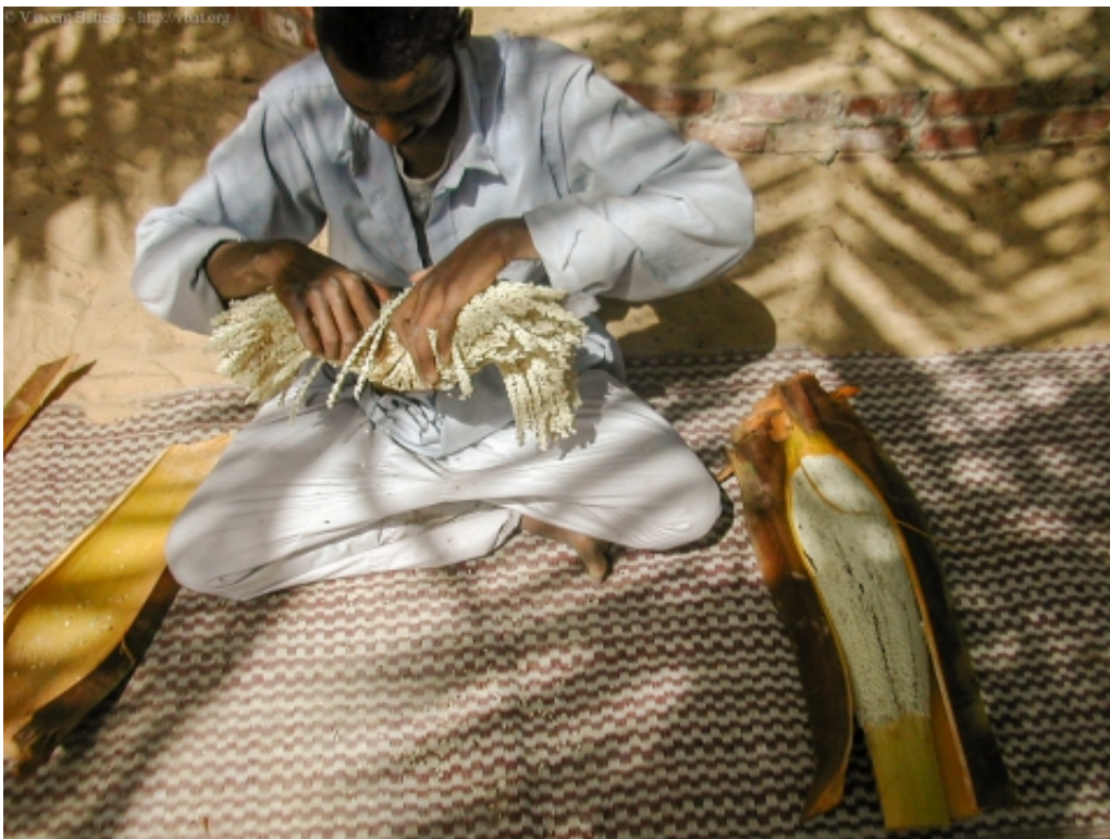
Figure 4 : Preparation of the pollen for hand-pollination of the date palm ( Phoenix dactylifera L.), Siwa oasis (Egypt), March 28 th , 2004