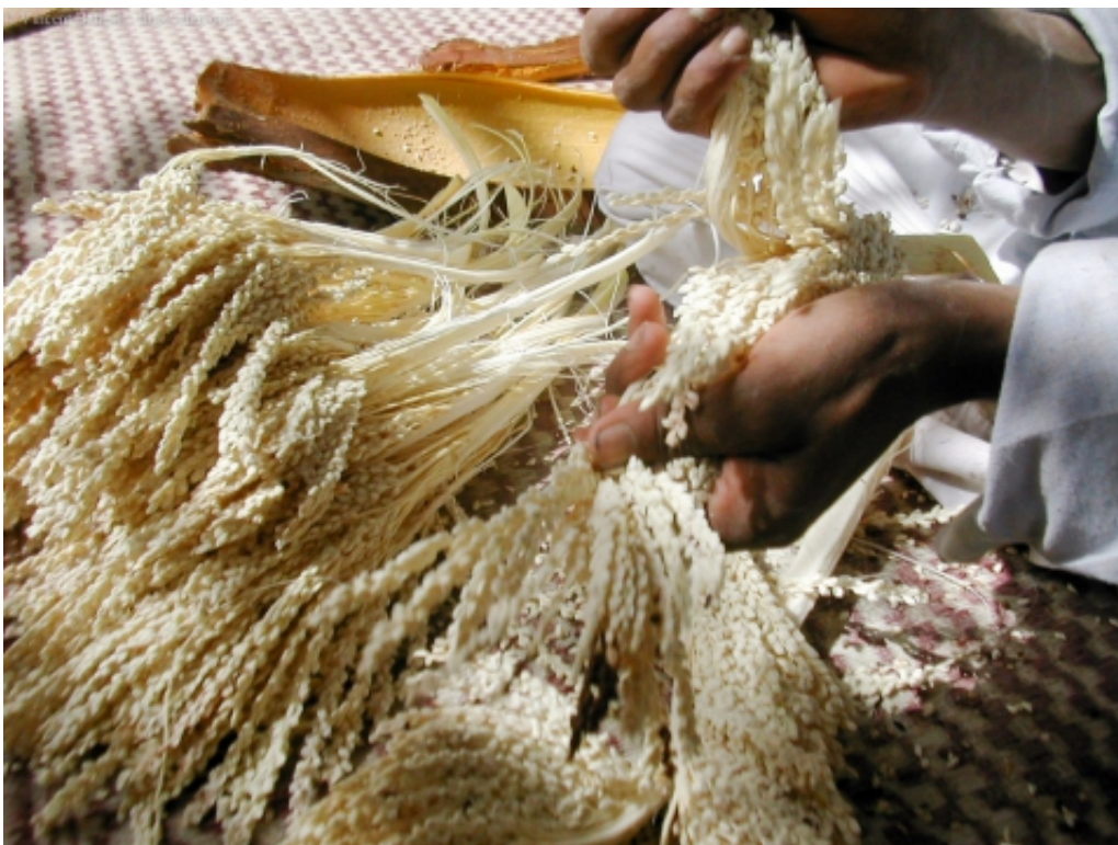
Figure 6 : Preparation of the pollen for hand-pollination of the date palm ( Phoenix dactylifera L.), Siwa oasis (Egypt), March 28 th , 2004