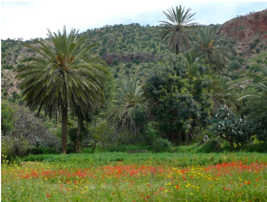
Figure 14 : An oasis with a field in bloom, Imi Ougouni, 2009

The mountains in the background are covered with euphorbia and argan trees