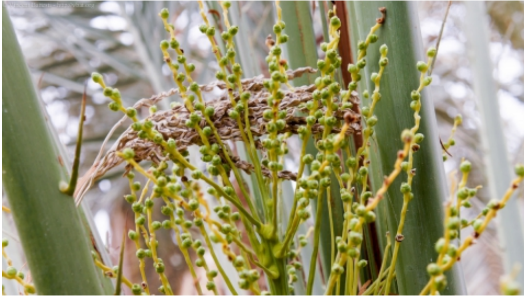
Figure 12 : Remains of a male spikelet in a growing female date inflorescence after human pollination, Siwa oasis (Egypt), May 8th, 2013

begins to form and open (Figure 12). After pollination, two of the three carpels fall; the third develops into a date. If pollination was badly conducted (or not performed), a parthenocarpic fruit, never appreciated and never sold, would grow instead of the fertilized ovary.