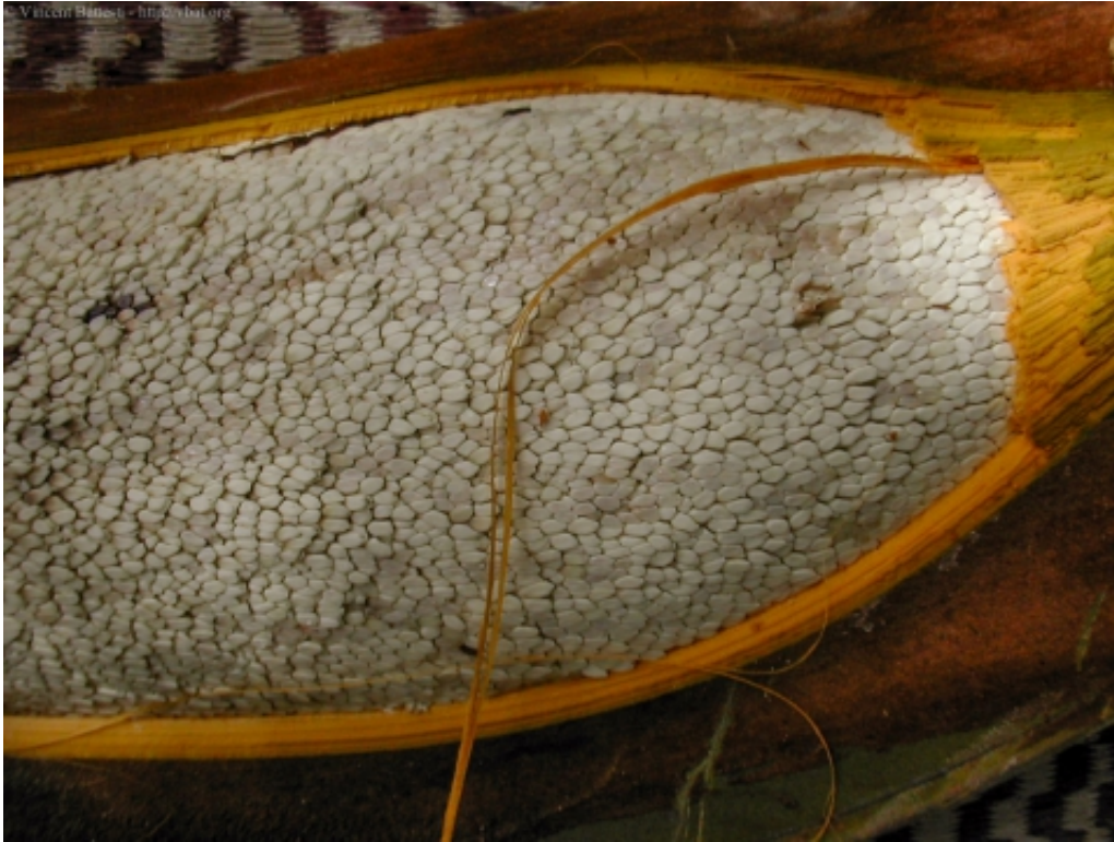
Figure 3 : The male inflorescence. Preparation of the pollen for hand-pollination of the date palm ( Phoenix dactylifera L.), Siwa oasis (Egypt), March 28 th , 2004

from pollinating on windy days, judging the temperature to be too low (Battesti 2005).