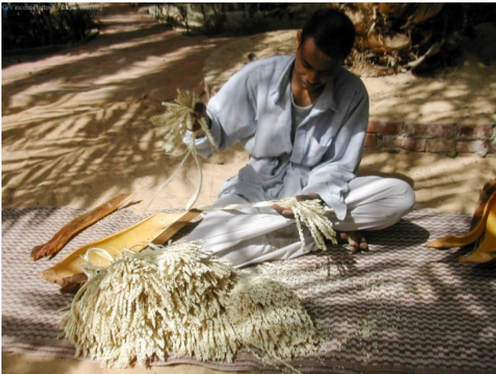
Figure 8 : Preparation of the pollen for hand-pollination of the date palm ( Phoenix dactylifera L.), Siwa oasis (Egypt), March 28 th , 2004