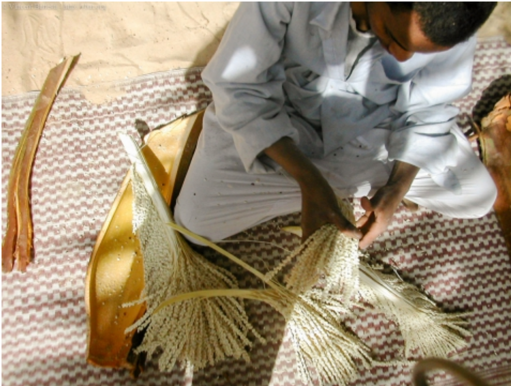
dactylifera L.), Siwa oasis (Egypt), March 28 th , 2004