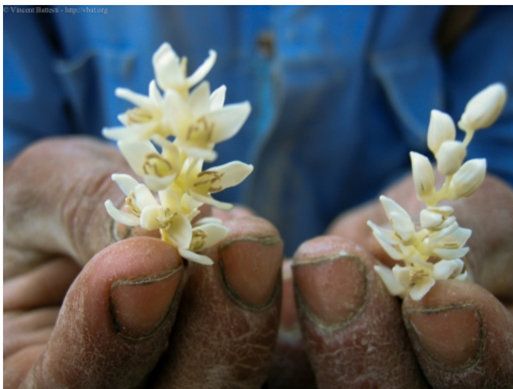
Figure 11 : The male flowers of date palm, harvested to hand pollinate the female date palm, Siwa oasis (Egypt), December 24 th , 2004