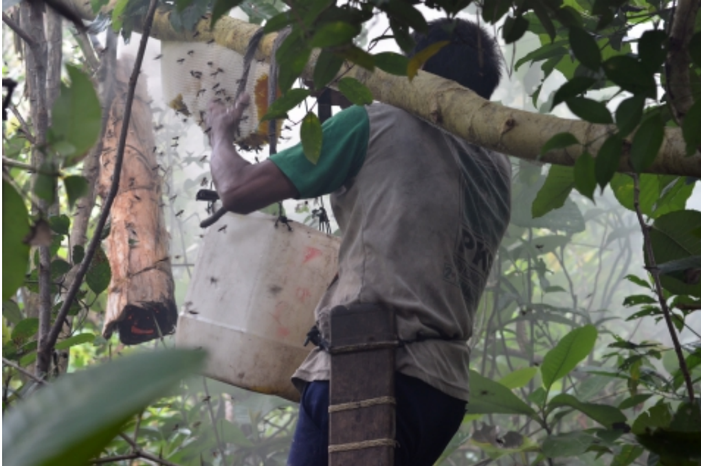
Figure 18 : After having cut the brood, the harvester takes the honey “head”. Belitung, 2011

42 And the time has come to harvest honey from the comb.