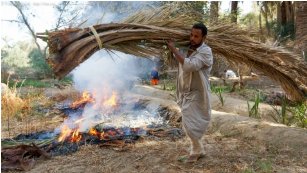
Figure 13 : In all of the Sahara, the date palm is the main crop and the keystone of oasis systems, Siwa oasis (Egypt), November 26th, 2013

While this interpretation is still debated, the Code of Hammurabi, the Babylonian law code of ancient Mesopotamia dating back to about 1754 B.C.E., seems to offer a consensual textual source for this practice, and we can ascertain that date palm pollination was practiced in Mesopotamia as early as the Old Babylonian Period, 20th to 16th centuries B.C.E. (Giovino 2007).