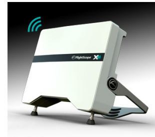
Figure 5. A FlightScope Radar

A real golf ball trajectory can be tracked using a combination of video tracking and radar (see Figure 5). Actually these devices are only used by professional athletes, and are designed by few companies. Connected to software, they allow an analysis of the ball's trajectory as well as the launch conditions (the way the ball is hit).