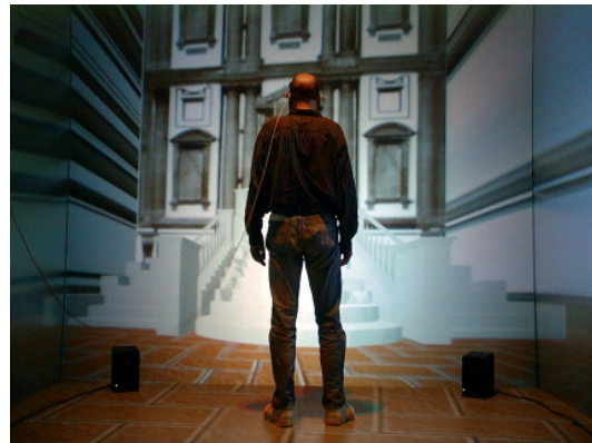
Figure 3. A CAVE Visual Display

three screen walls, a roof screen and a floor screen. The user can move in the three-square meters space. This immersive environment is commonly equipped with motion tracking.