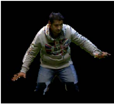
Figure 4. Multiple Kinect-based real-time 3D reconstruction based on CETH/ITI approach [18]

Body and motion capture is used for two main goals: body reconstruction and activity recognition. The first one allows building a realistic avatar that increases the degree of immersion. Activity recognition allows improving the performances of sportsmen by analyzing their movements. It provides three-dimensional data of the golfer's swing that allow improving his swing plan. Moreover, the presence of an avatar moving exactly like the real user enhances the presence feeling of the other sportsman. The social interaction is expected to bring a much deeper feeling of presence.