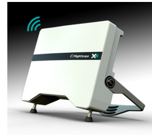
Figure 5. A FlightScope Radar

A real golf ball trajectory can be tracked using a combination of video tracking and radar (see Figure 5). Actually these devices are only used by professional athletes, and are designed by few companies. Connected to software, they allow an analysis of the ball's trajectory as well as the launch conditions (the way the ball is hit).