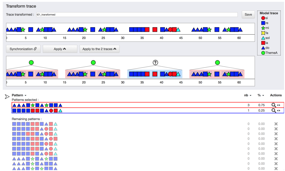
Fig. 2. Main interface of TRANSMUTE

Figure 2 shows the interface of TRANSMUTE which has three main parts. The upper part displays the trace being analyzed. The middle part represents the working trace in which patterns are displayed. The bottom part displays the patterns outputted by the miner. The trace model is displayed on the right hand side.