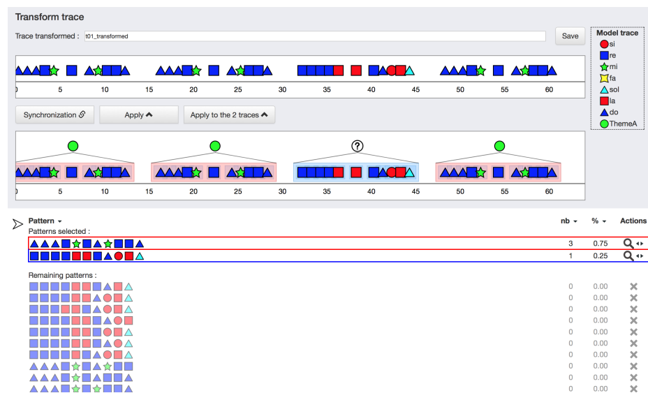
Fig. 2. Main interface of TRANSMUTE

Figure 2 shows the interface of TRANSMUTE which has three main parts. The upper part displays the trace being analyzed. The middle part represents the working trace in which patterns are displayed. The bottom part displays the patterns outputted by the miner. The trace model is displayed on the right hand side.