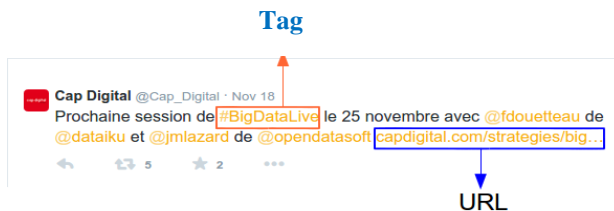
Figure 1 : An example of social interaction

Since the arise of numerical social networks (such as Facebook 1 , Flickr 2 , Twitter 3 , etc.), users got the possibility to create their own content (photos, movies,...) and share it. These new interactions allow users to be more actives. Cognitive intelligence emerges and social information with added valued is produced such as tags (labels, keywords), comments, judgments, bookmarks...[6]. Figure 1, shows an example of these interactions on a social tagging system Twitter.