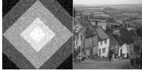
Fig. 1. Pyramid and Goldhill images.

An image processing illustration of Proposition 2 is provided in the first two columns of Fig. 2. The original 8-bit images are noisy versions of a synthetic one of size 100 \times 104 called Pyramid and of a natural scene of size 512 \times 512 called Goldhill, displayed in 1. The graph consists here of a regular 4-connected grid. As expected, nonlinear filters ranging from a dilation (on the left) to an erosion (on the right) are generated, with the local averaging (third image) as a special case.