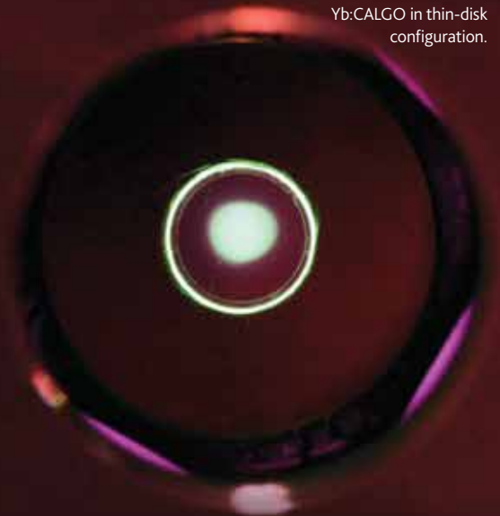
Yb:CALGO in thin-disk configuration.

Amplitude Systemes (AS) is one of the international market leaders in the field of femtosecond lasers based on Yb-doped materials