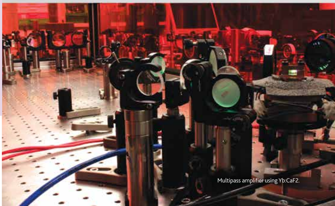
Multipass amplifier using Yb:CaF 2 .

The importance of these breakthroughs is shown in the calibre of experiments using the FEMTOCRYBLE consortium's research. "All of the improvements made by the FEMTOCRYBLE laboratories concerning crystal growth and laser demonstration highlight the interest in the crystals, and increase their status in the laser community," Druon reflects.