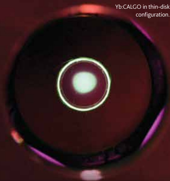
Yb:CALGO in thin-disk configuration.

Amplitude Systemes (AS) is one of the international market leaders in the field of femtosecond lasers based on Yb-doped materials