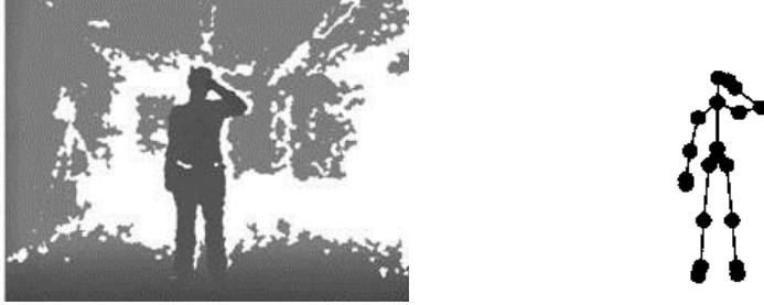
Fig. 1. (a) Depth map image. (b) Skeletal joints positions proposed by [15]

The hip center is considered as the center of coordinate system, and the horizontal direction is defined according to left hip and right hip junction. The remaining 4 skeletal locations are used for poses joint angles descriptor.