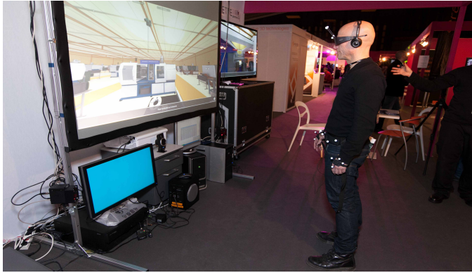
Figure 5: View of the collaborative scenario with one user.

The C 2 BDI architecture has been integrated with the interaction model for virtual and real human [16] on the GVT platform [17]. The behavior realiser module interacts with the associated virtual agent, and sends requests to it, to perform actions chosen by the decision-making module or by the dialogue manager (turn taking behavior). The user interacts with VE by controlling his avatar thanks to a tracking system of the body and hands. Furthermore, the platform has also been enriched by a voice interface system that uses voice recognition and synthesis of Microsoft (see Fig. 5)].