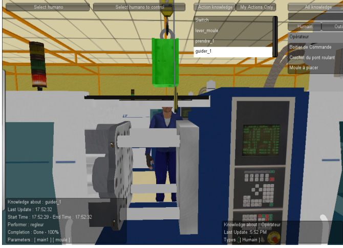
Figure 3: Collaborative realisation of the maintenance procedure in the virtual environment.

machine (see Fig. 3). This specific intervention requires a precise coordination of tasks between two workers: the setter and the machine operator. The use of autonomous agents allows the learner to execute the learning procedure.