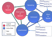
Fig. 1. A general view of our turn-taking model.

and para-linguistic features. The agent model is based on a Turn-Taking system by Ravenet et al. (in press), that we modified. The model in itself can be shown in Fig. 1.