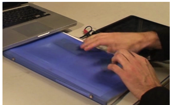
Figure 3: Piezo microphones under a corrugated plastic folder, allowing to hit, scratch, and strum a corpus.

The attack detection is not 100% accurate, but since the signal from the piezos is mixed to the audio played by CATART, the musical interaction still works.