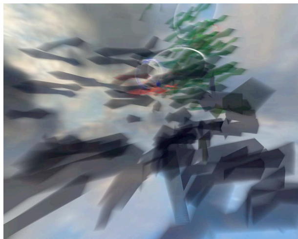
Figure 2. Plumage 's 3D space.

How does Plumage realize the project of a navigable score? The navigation is not a simple movement of a cur-