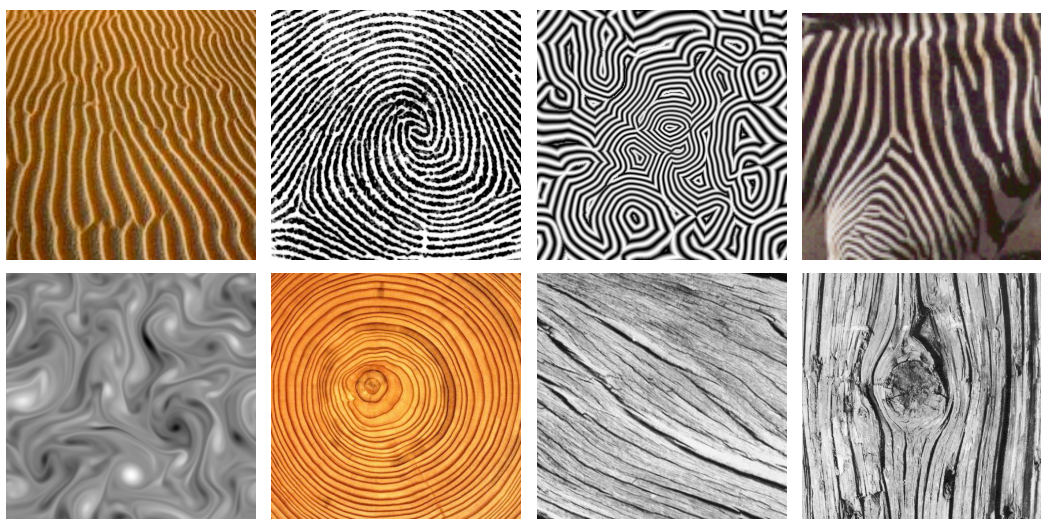
Figure 2: Examples of natural and synthesised oriented oscillating patterns from Peyré [70].

Sound design is the wider context of creating interaction sounds, sound scapes, and sound textures. Literature in the field often contains useful methods for sound texture design [10, 14, 58–61].