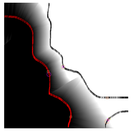
Figure 2 . Map of the interpolation factor f_{23} as greyscale values (black is one).

point is never hidden beyond the zone borders from all other zones.