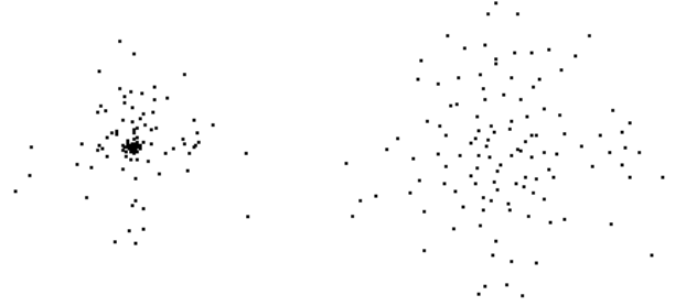
Figure 2. Effect of repulsion (right) on a cluster (left).

The effect of the repulsion force can be seen in figure 2, where a cluster of overlapping points is distributed in space to reveal all sounds.