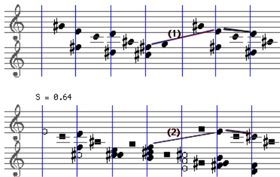
Figure 3 (see part 5 for details on the symbols): Two similar patterns in Pierrot Lunaire from Schoenberg. Lines (1) and (2) show similar contours.

As above, the only events falling on a downbeat (dwb.events) are considered. An up (down) contour is the sequence of the intervals between the upper (lower) pitches of the dwb.events. Each contour of each sequence is compared with the two contours of the other sequence. Contours are very similar (see figure3) if the intervals from one sequence are similar to the corresponding intervals from the other sequence (two intervals are similar if their difference is less than 5 half tones).