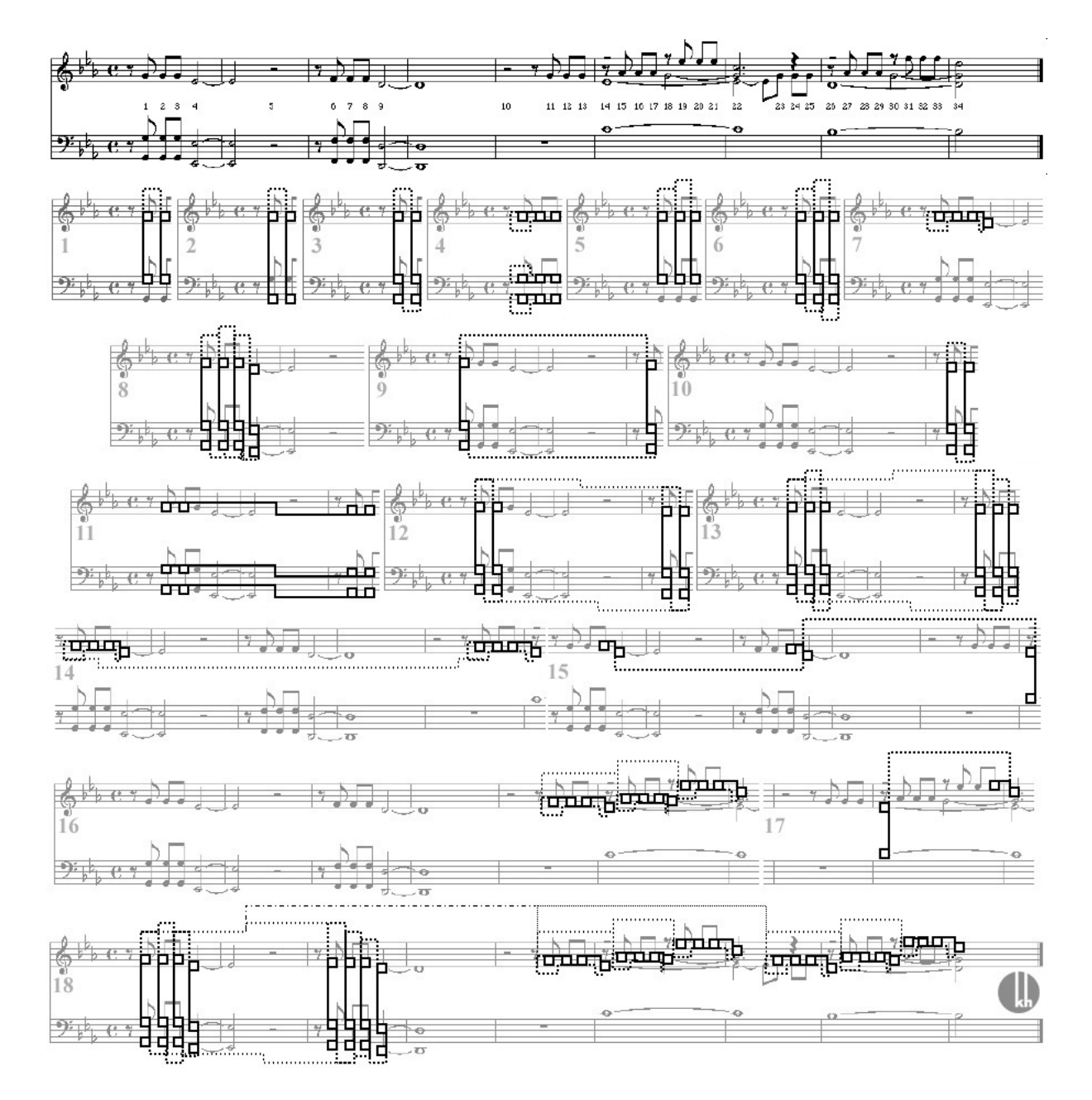
Figure 3: kanthume analysis of piano reduction of the nine first bars of Beethoven's fifth symphony.