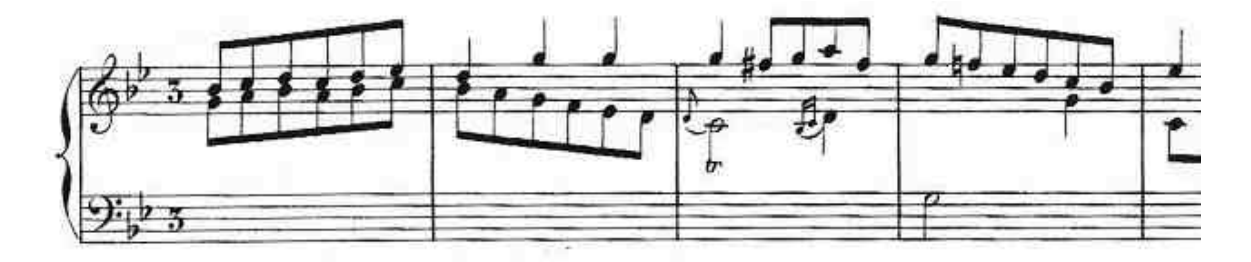
Figure 3 : The score of the first 7 seconds of "L'indifférente"

The first 7 seconds of "L'indifférente" and their analysis are presented in figure 2. The initial beat level which has been chosen corresponds to the eight note of the score.