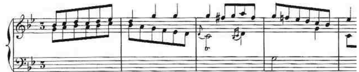
Figure 3 : The score of the first 7 seconds of "L'indifférente"

The first 7 seconds of "L'indifférente" and their analysis are presented in figure 2. The initial beat level which has been chosen corresponds to the eight note of the score.