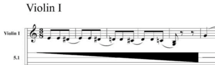
Figure 1 : a notation of spatialization for a 5.1 system

Moreover, some tries to achieve notation of spatialization of the score becomes dependent on the physical implementation, like the following one that is dependent on a 5.1 system [Ellberger 06]: