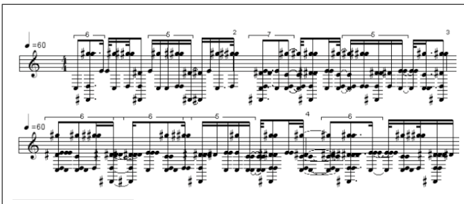
Figure 1: The OpenMusic Voice object displays a series of progressive deformations of an initial rhythmic pattern

The section title "Fourier Scratching" refers to a manipulation of rhythms through gestural distortions of their Fourier images. The "Fourier DJ" grabs a Fourier coefficient and moves it in order to modify the entire rhythm in a subtle way. The theory guarantees the existence of the inverse transform. Of course, the musical interpretation depends on a suitably chosen quantification of the musical time and intensity. Figure 1 shows an example for a series of progressive rhythm deformations.